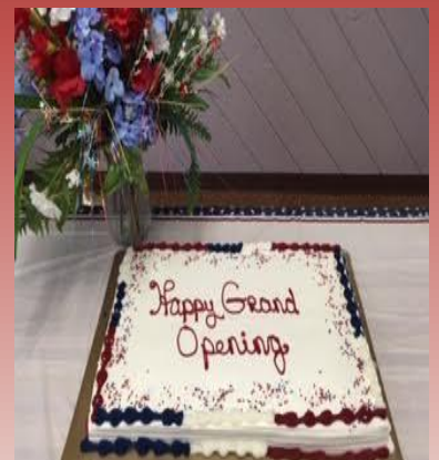
No celebration is complete without a cake.