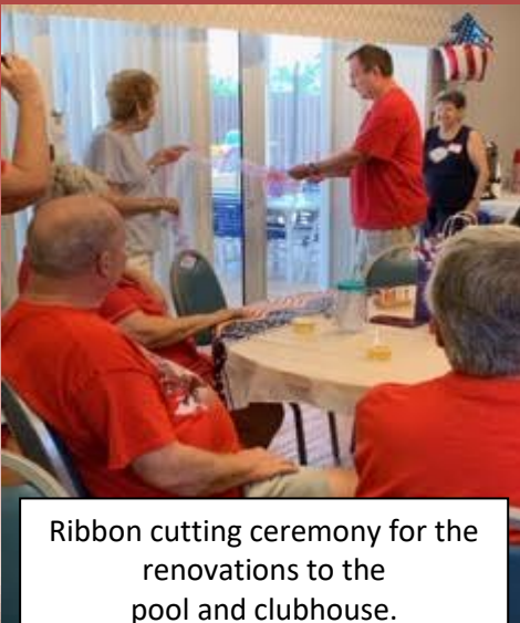
Ribbon cutting ceremony for the renovations to the pool and clubhouse.

On July 4 th , 57 friends and neighbors came together for food, fun, and festivities. Games were played, yummy food was eaten, friendships were rekindled, and the clubhouse renovations were celebrated. If you haven't seen the "facelift" to the facilities make sure you pay a visit to the clubhouse and pool. These renovated amenities were completed to make your clubhouse, pool, and tennis courts the best Lucerne Lakes South, has to offer!