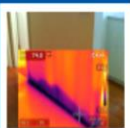
Moisture/ Leak Detection