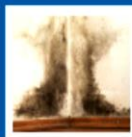
Toxic Black Mold Removal

Concerned about mold? Talk to the experts with over 10+ years of experience