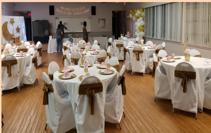
Lucerne Lakes Clubhouse set up for a recent baby shower.