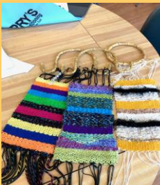
April's project: Woven wall hangings