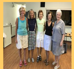
March's project: From shirt to skirt

You are welcome to join this class even if you have no talent. There are always members of the group who are willing to help you.