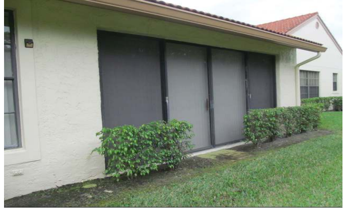
UNPROTECTED GLAZED DOORS