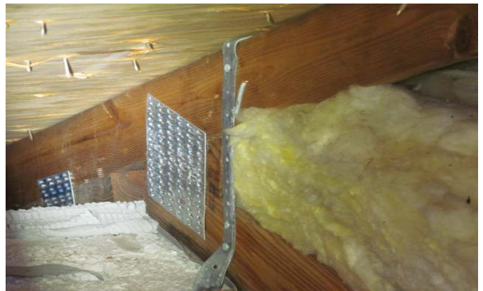
ANCHOR SIDE OF METAL CONNECTOR WITH 2 NAILS