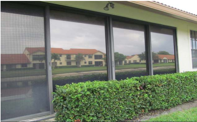
UNPROTECTED GLAZED DOORS