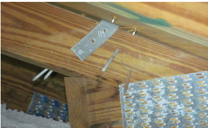
OPPOSING SIDE OF METAL CONNECTOR WITH 1 NAIL