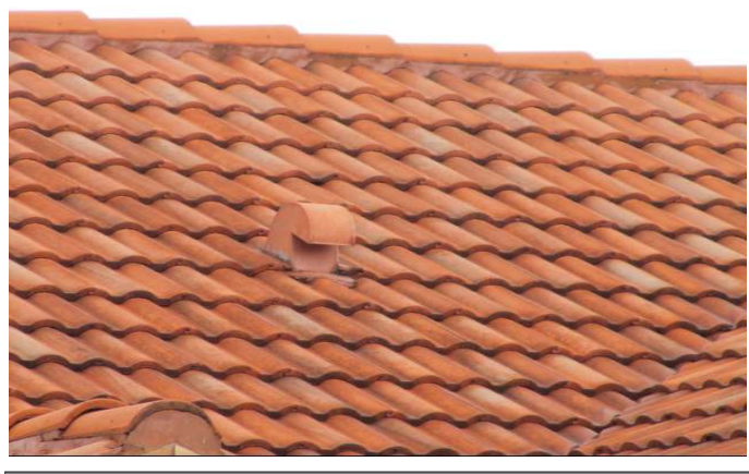
TILE ROOF COVERING

Florida Inspection Center All Rights Reserved. (888) 646-4651