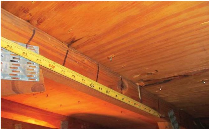
NAILS SPACED 6" IN THE FIELD