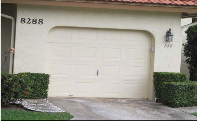
UNVERIFIED GARAGE DOORS