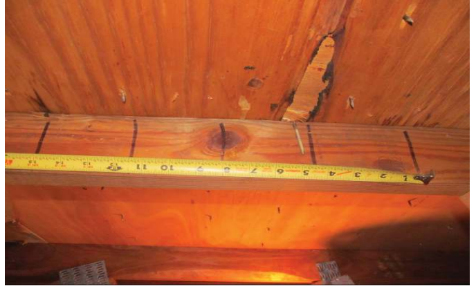
NAILS SPACED 6" ON THE EDGE