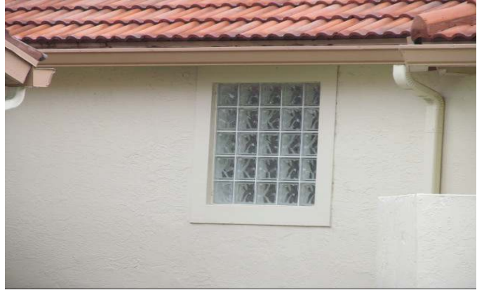
UNPROTECTED GLASS BLOCK