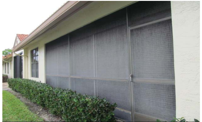
PROTECTED WITH UNVERIFIED SHUTTERS