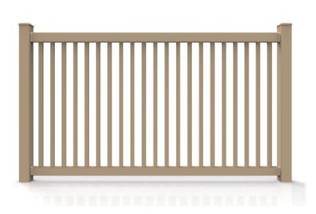
Open Vinyl Fence