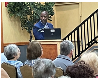
Baywinds Community Association Town Hall Security Meeting