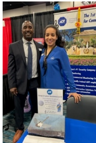
CAI Central Florida Music Themed CA Day & Trade Show with Joe Bonamassa themed giveaway