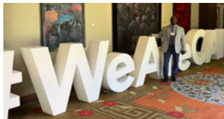
2023 CAI Annual Conference & Expo Dallas, TX