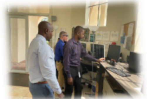
Setting up Dual Monitoring at The Oaks at Boca Raton