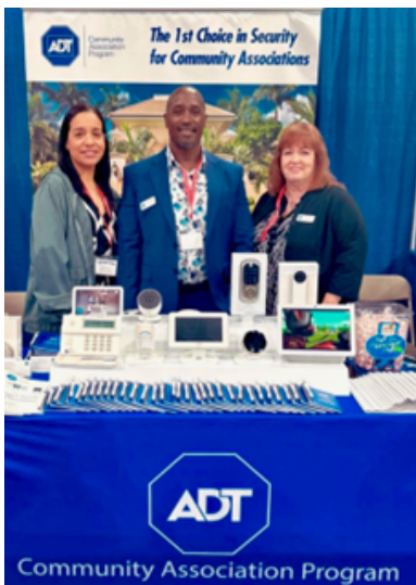
CAI South Gulf Coast Trade Expo