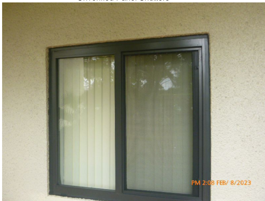
Unverified Impact Window