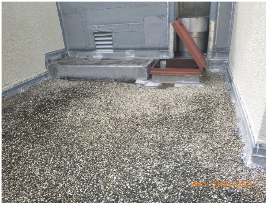
Built Up Tar & Gravel Roof Covering