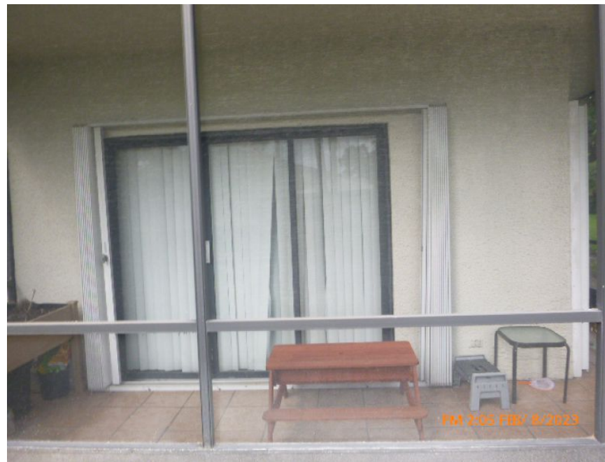
Unverified Accordion Shutter