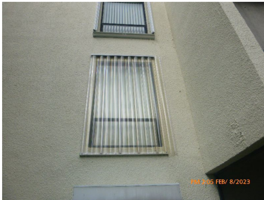
Unverified Panel Shutters