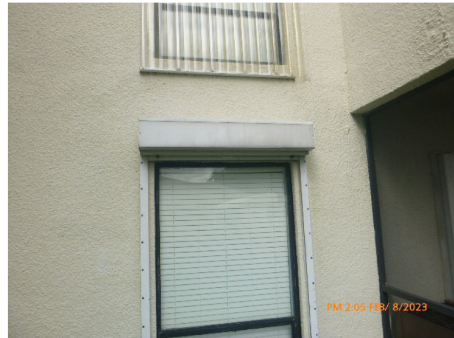
Unverified Roll Down Shutter