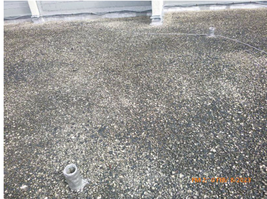
Built Up Tar & Gravel Roof Covering