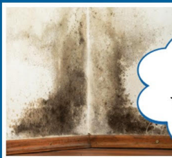
Toxic Black Mold Removal

Concerned about mold? Talk to the experts with over 10+ years of experience