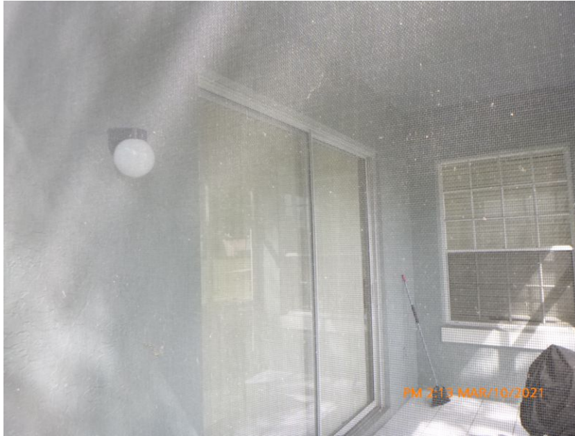
Unprotected Glazed Entry Door