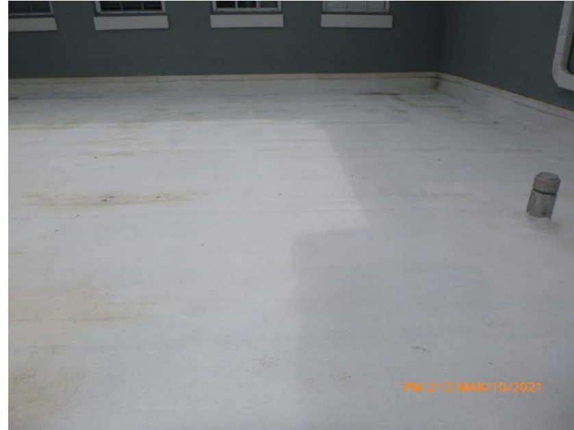
Built-Up/Rolled Asphalt Roof Covering