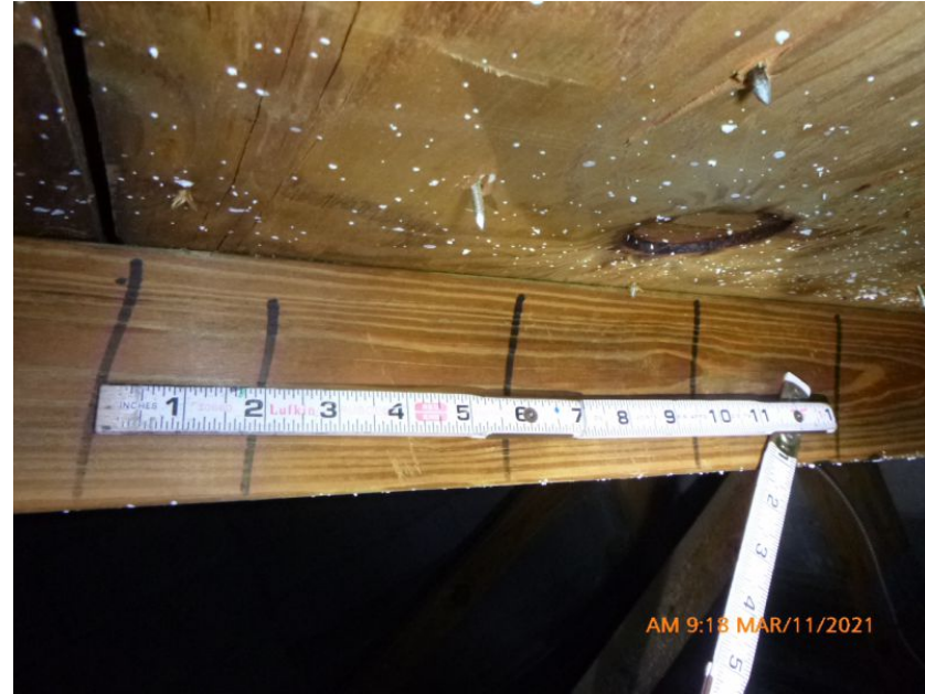
8d Nails or Greater in Size Spaced 6" Along the Edge