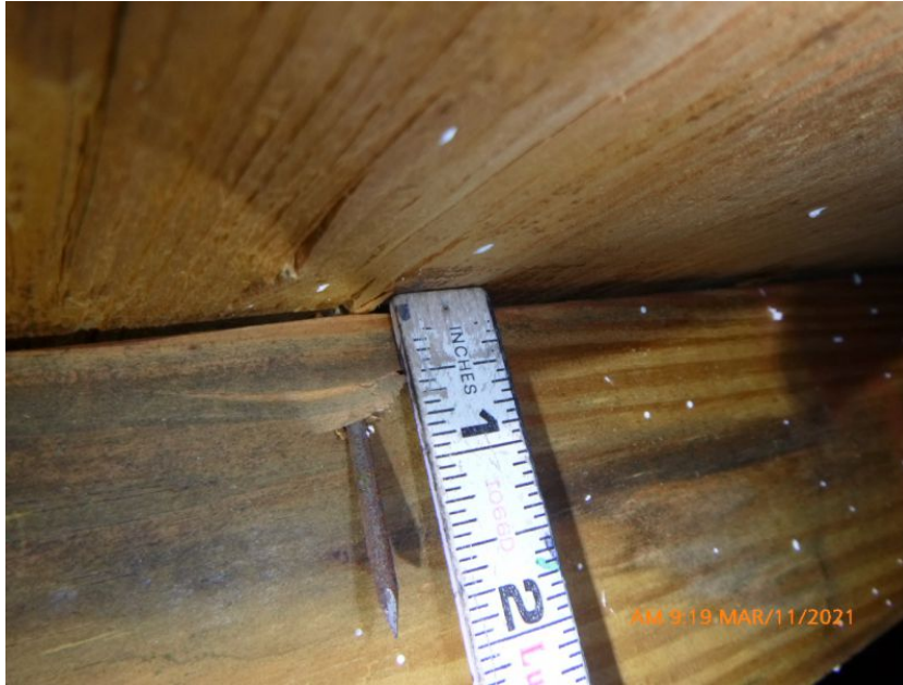
8d Nails or Greater in Size