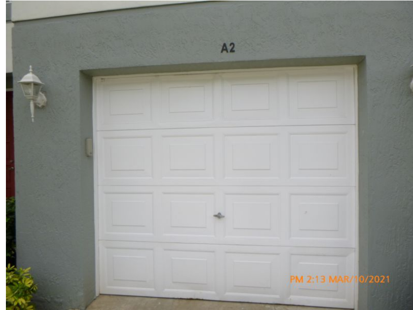
Unprotected Solid Garage Door