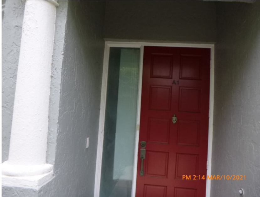
Unprotected Solid Entry Door