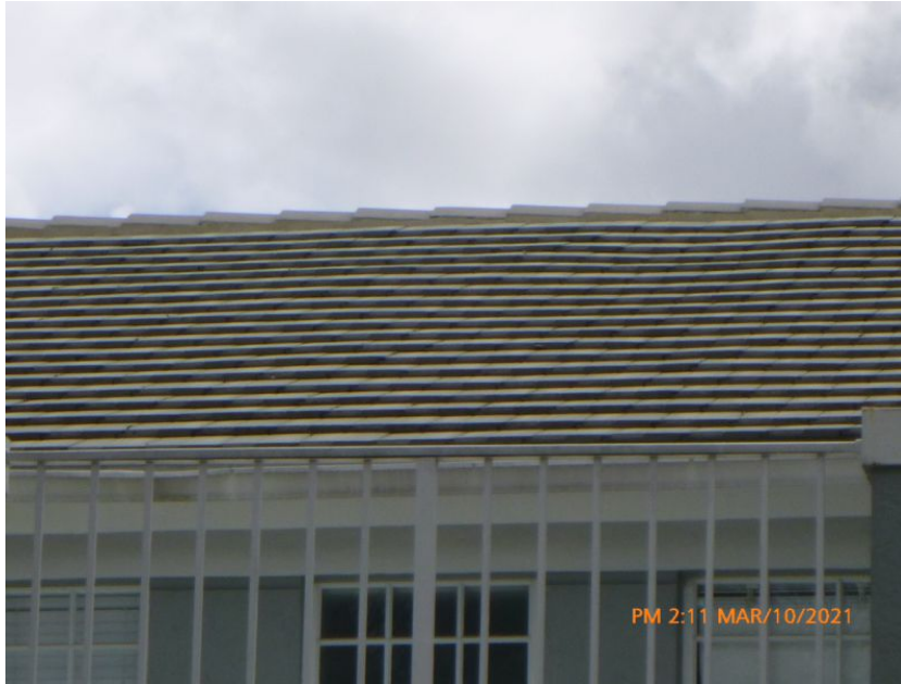
Concrete/Clay Tile Roof Covering