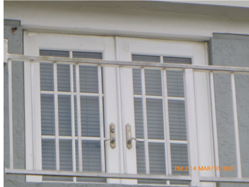
Unprotected Glazed Entry Door