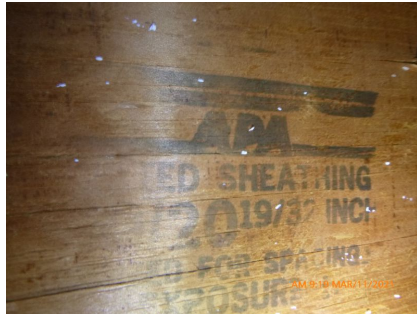
19/32" Deck Thickness Confirmed