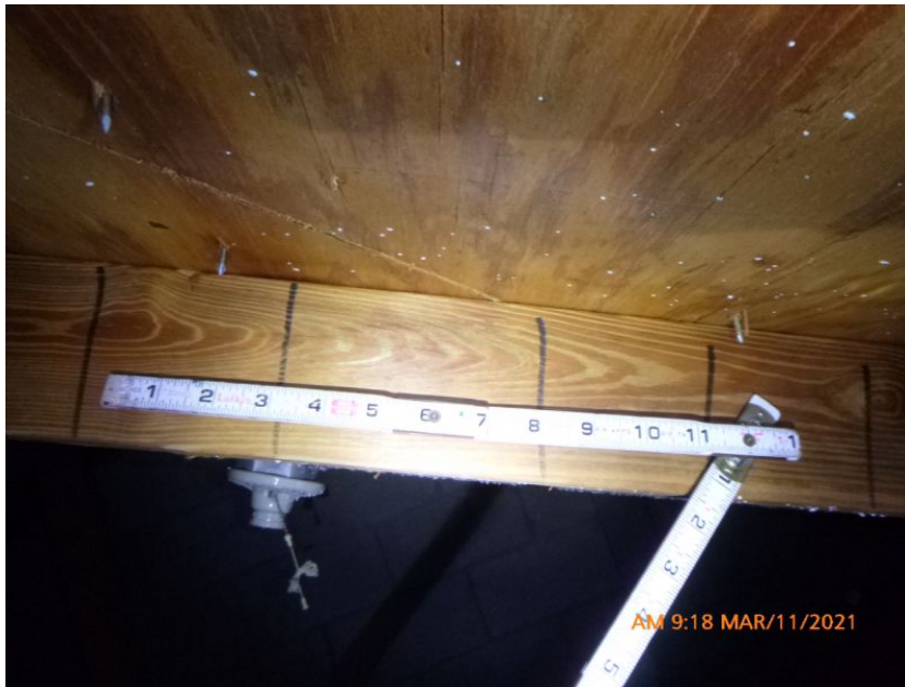
8d Nails or Greater in Size Spaced 6" in the Field