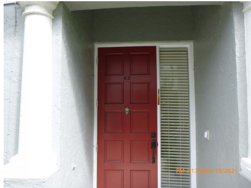
Unprotected Solid Entry Door