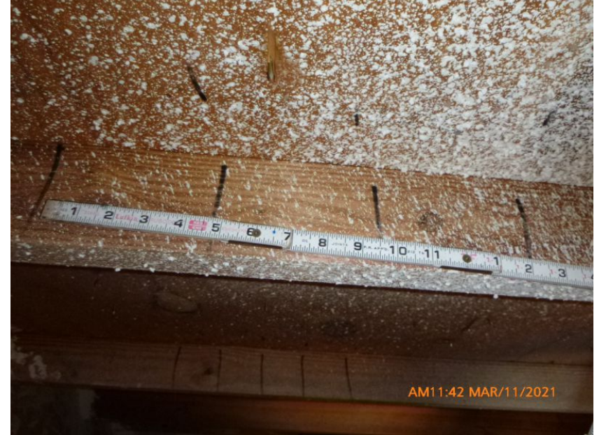
8d Nails or Greater in Size Spaced 6" in the Field