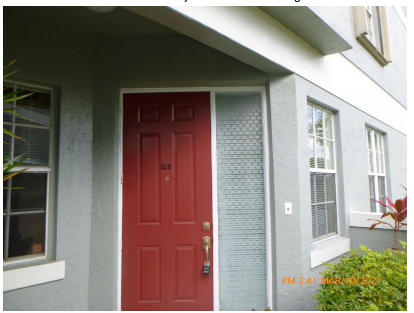
Unprotected Solid Entry Door