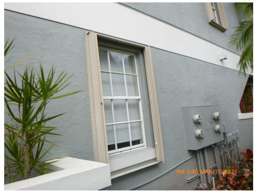
Accordion Shutter - Unverified as Impact