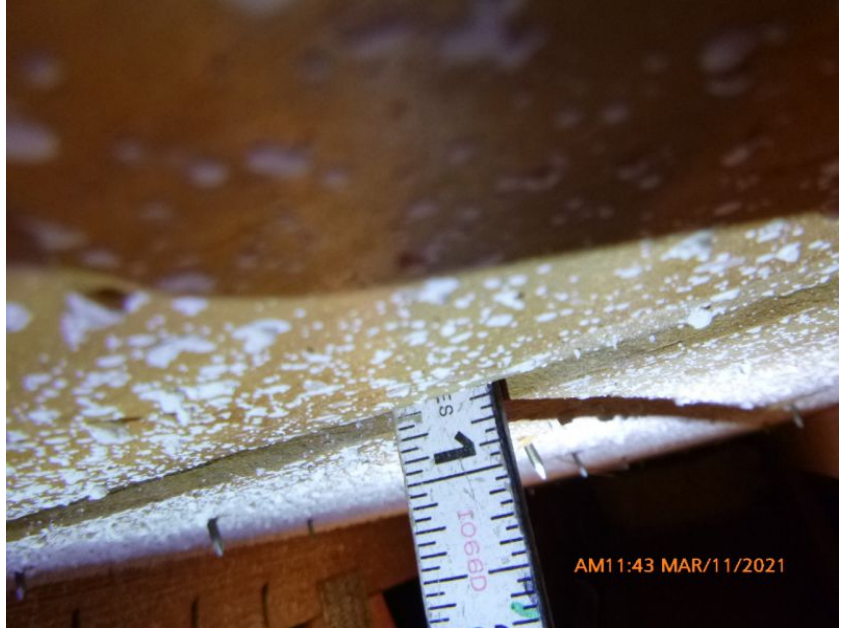
19/32" Deck Thickness Confirmed

8d Nails or Greater in Size Spaced 6" Along the Edge