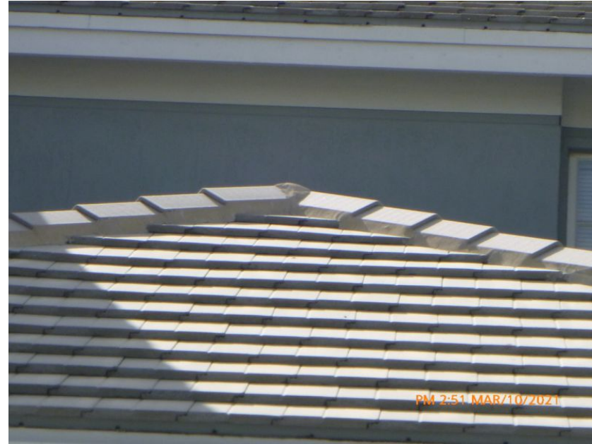
Concrete/Clay Tile Roof Covering