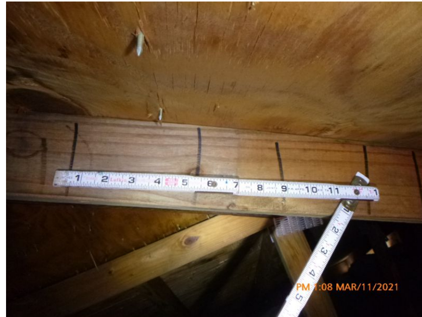
8d Nails or Greater in Size Spaced 6" in the Field