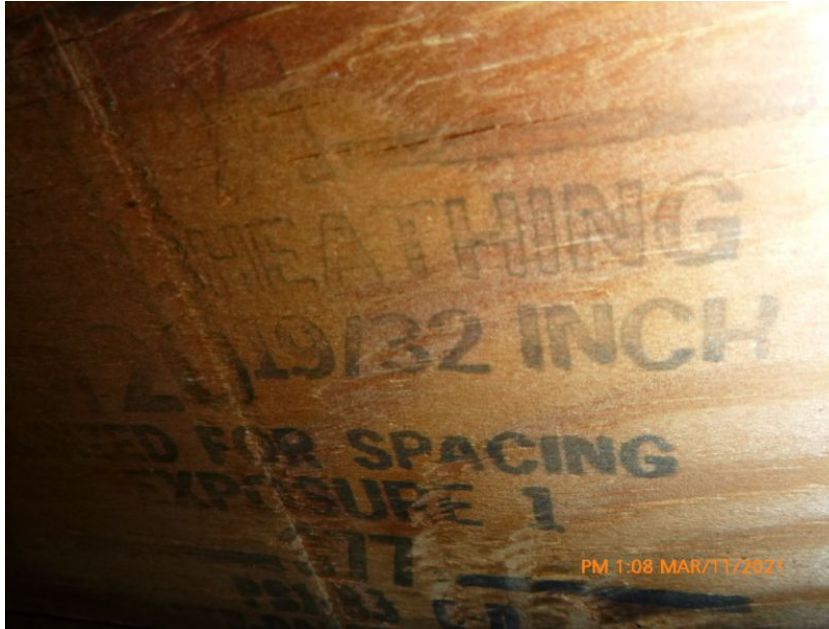
19/32" Deck Thickness Confirmed