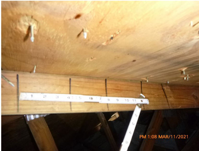
8d Nails or Greater in Size Spaced 6" Along the Edge