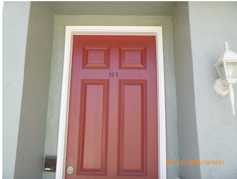
Unprotected Solid Entry Door