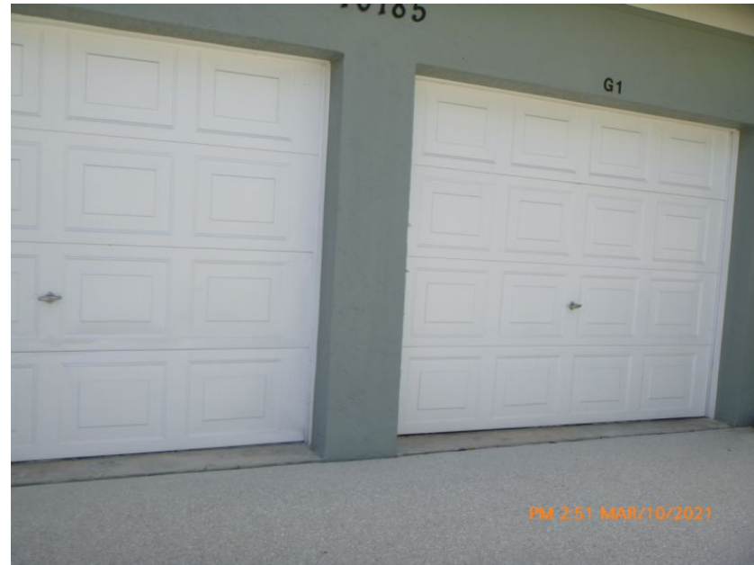
Unprotected Solid Garage Door