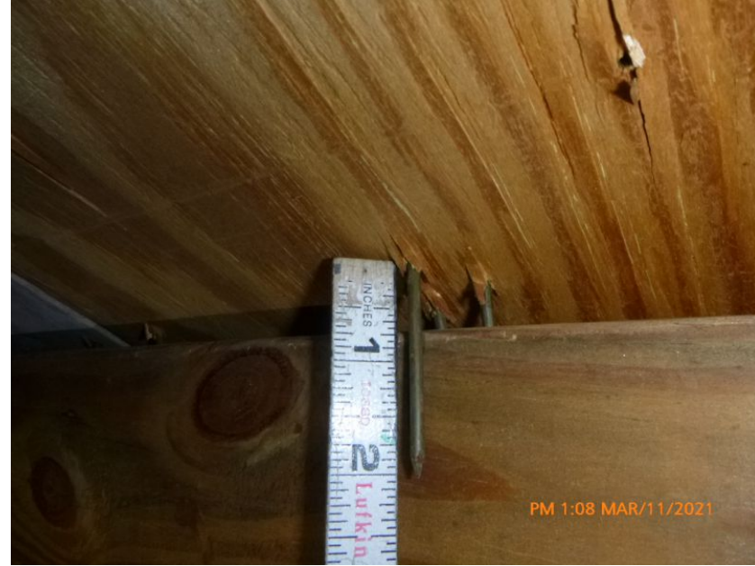
8d Nails or Greater in Size