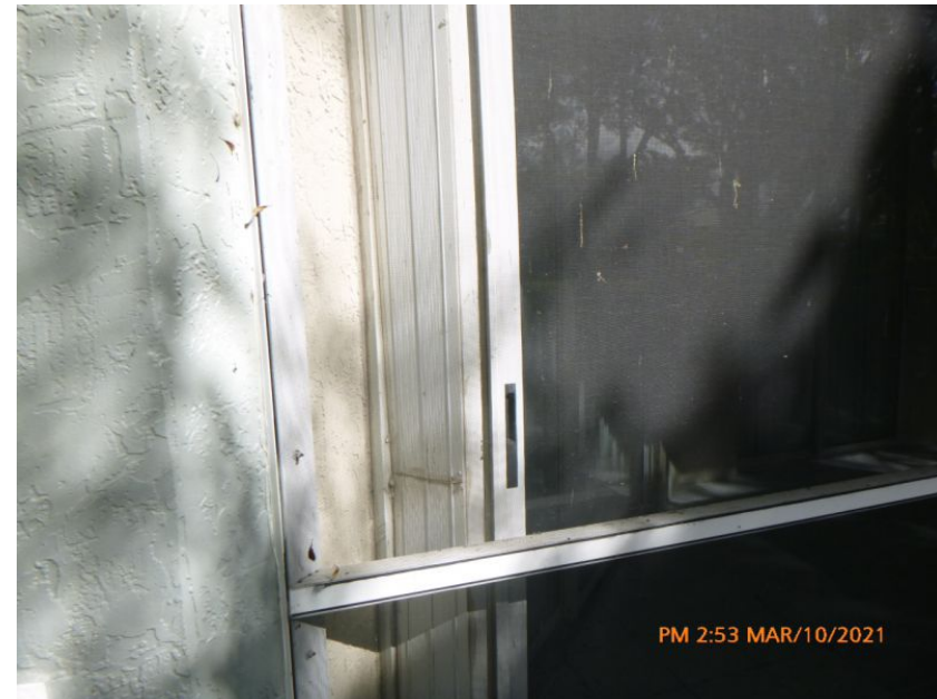
Accordion Shutter - Unverified as Impact