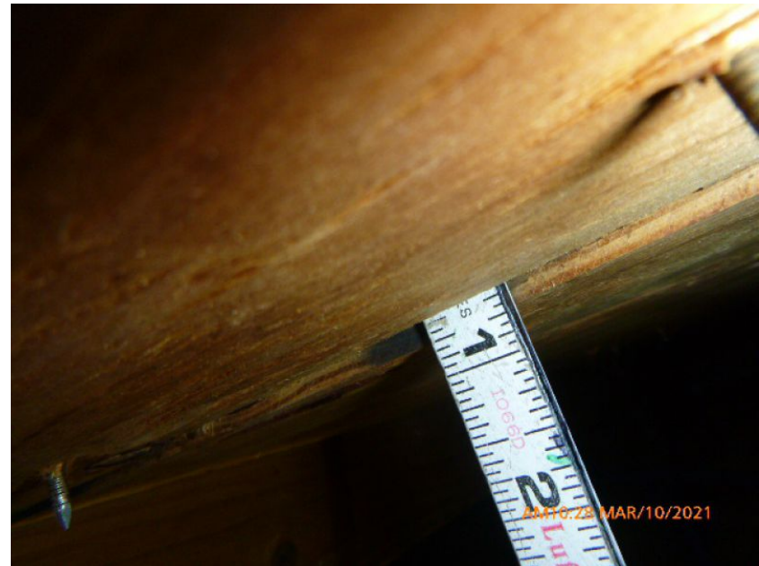
19/32" Deck Thickness Confirmed