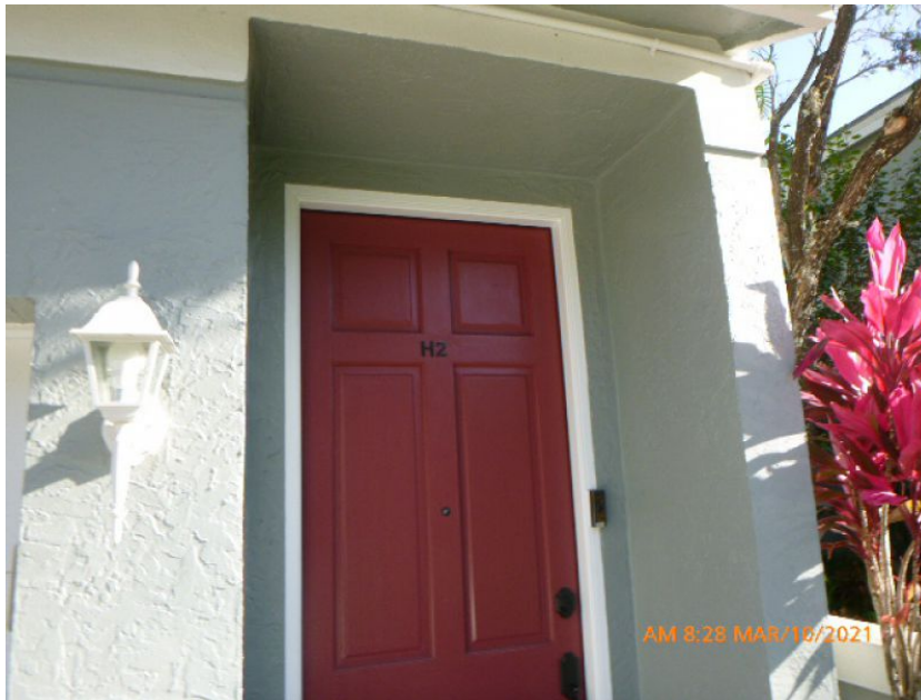
Unprotected Solid Entry Door