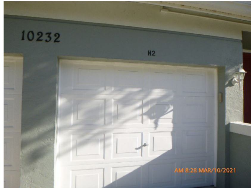
Unprotected Solid Garage Door