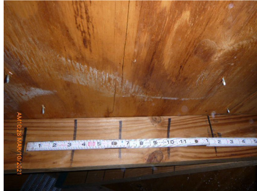
8d Nails or Greater in Size Spaced 6" Along the Edge