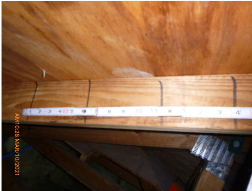
8d Nails or Greater in Size Spaced 6" in the Field