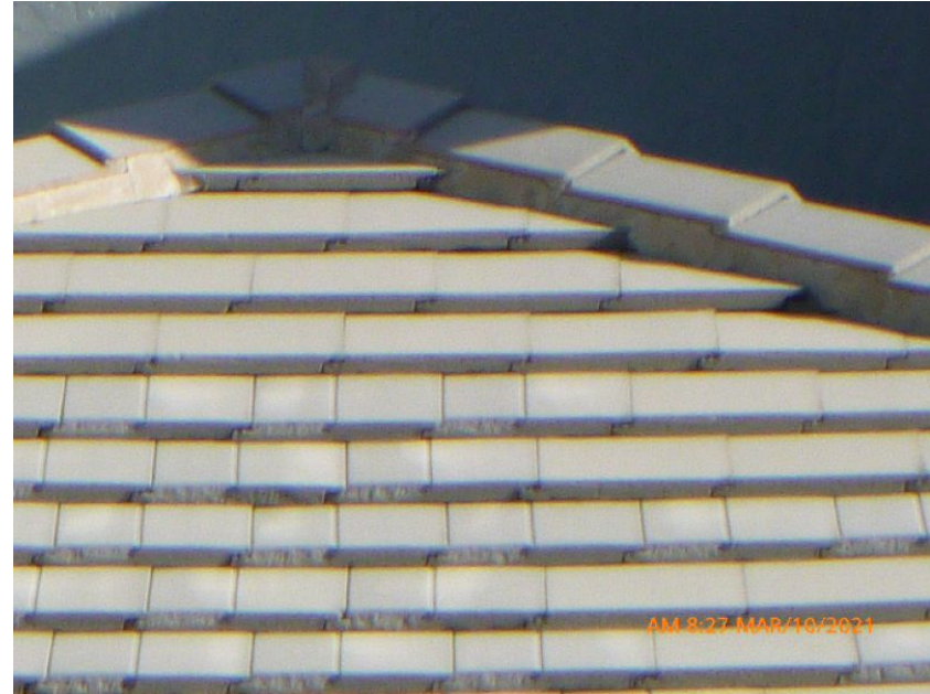
Concrete/Clay Tile Roof Covering