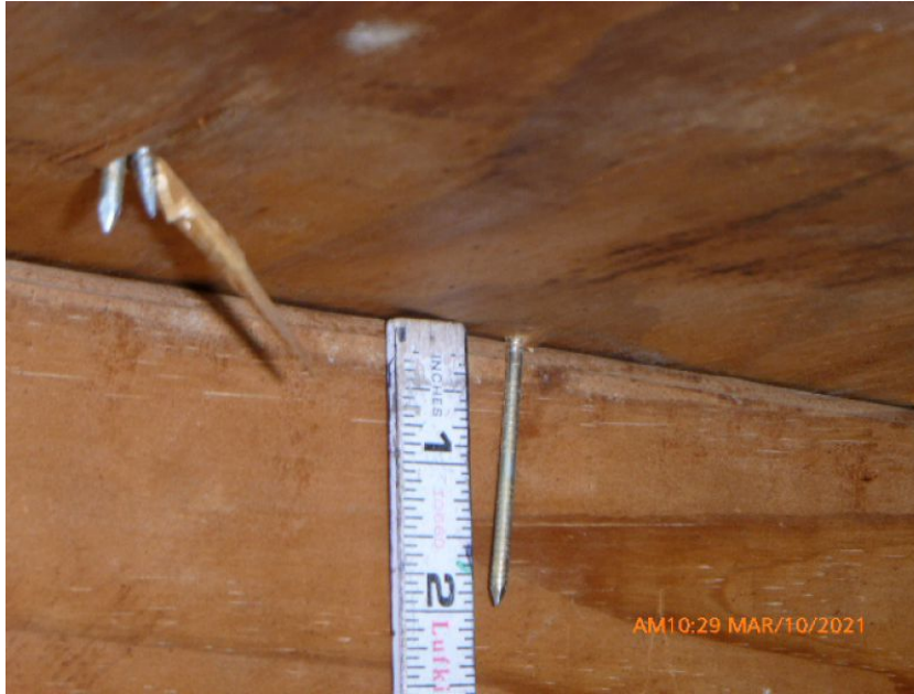
8d Nails or Greater in Size