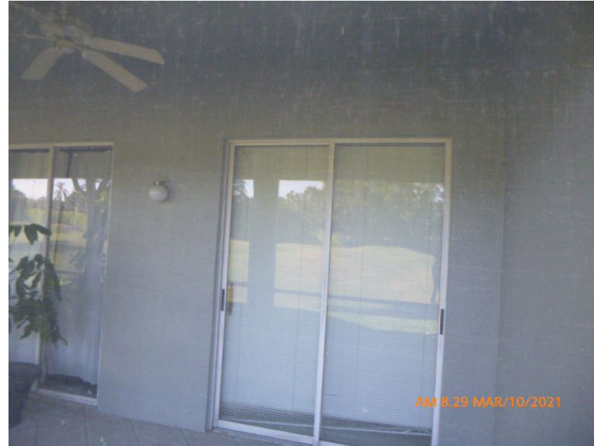
Unprotected Glazed Entry Door