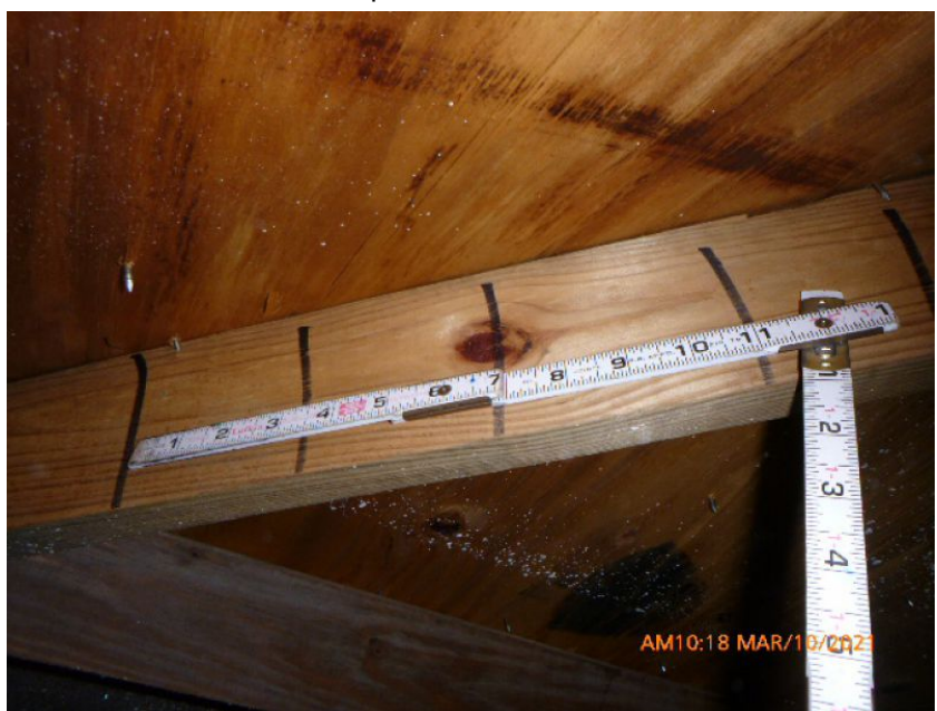
8d Nails or Greater in Size Spaced 6" Along the Edge