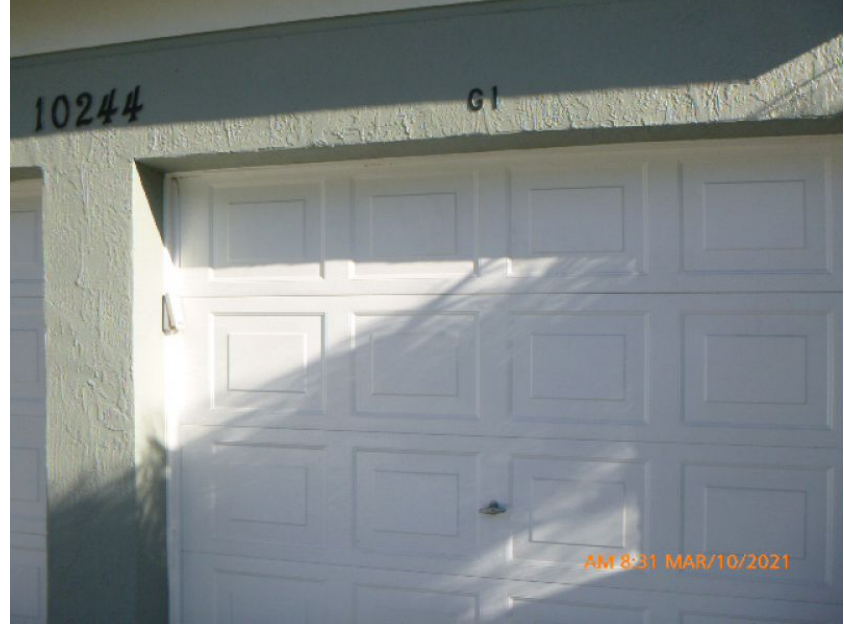
Unprotected Solid Garage Door