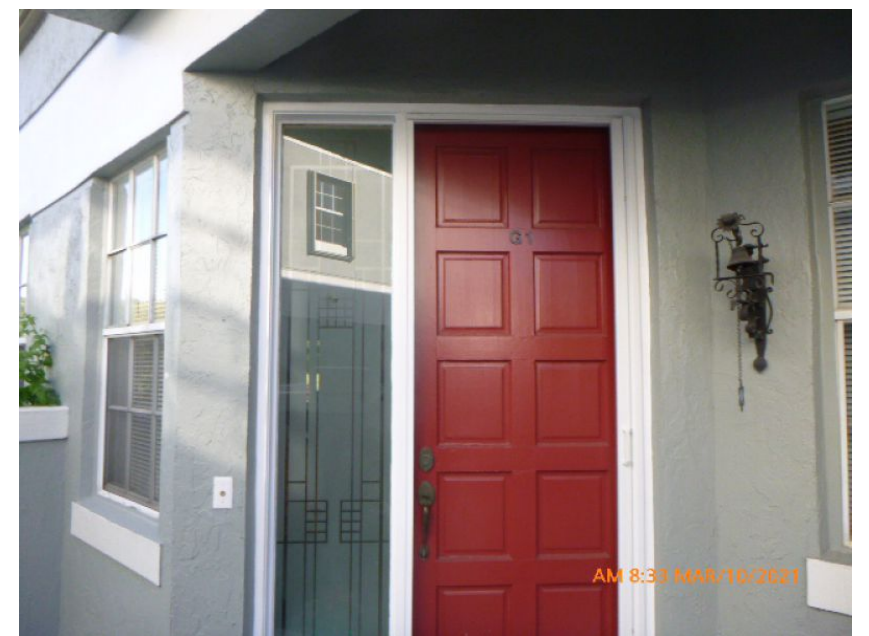
Unprotected Solid Entry Door