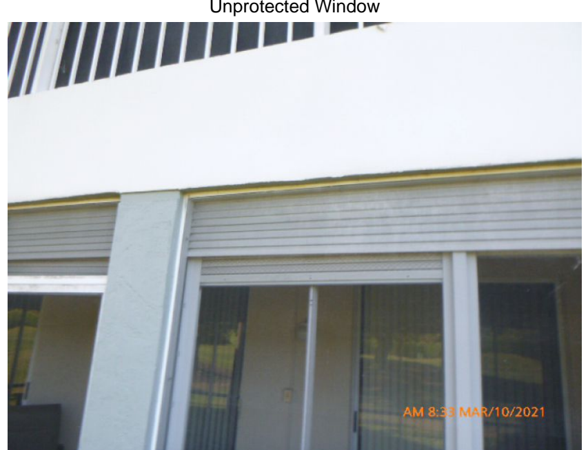
Rolldown Shutter - Unverified as Impact