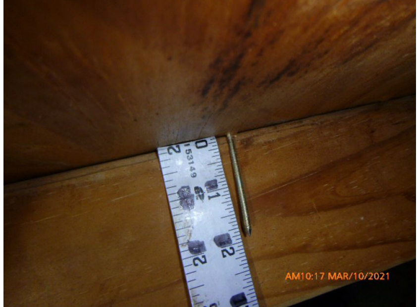
8d Nails or Greater in Size