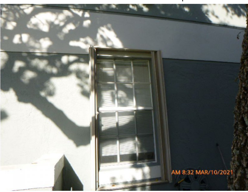
Non-Impact Rated Accordion Shutter

Accordion Shutter - Unverified as Impact