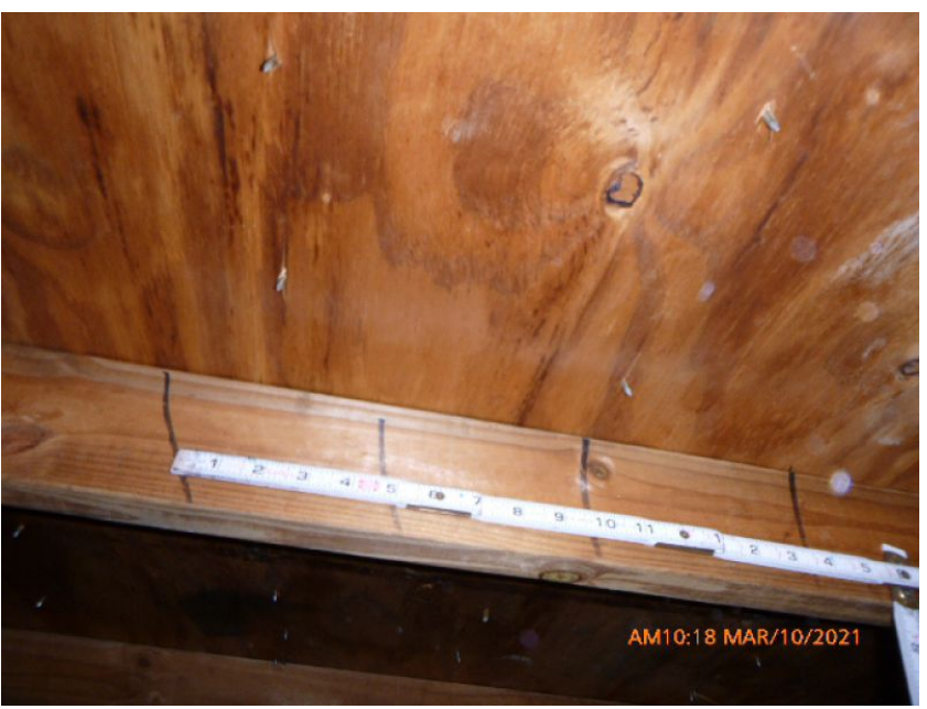
8d Nails or Greater in Size Spaced 6" in the Field