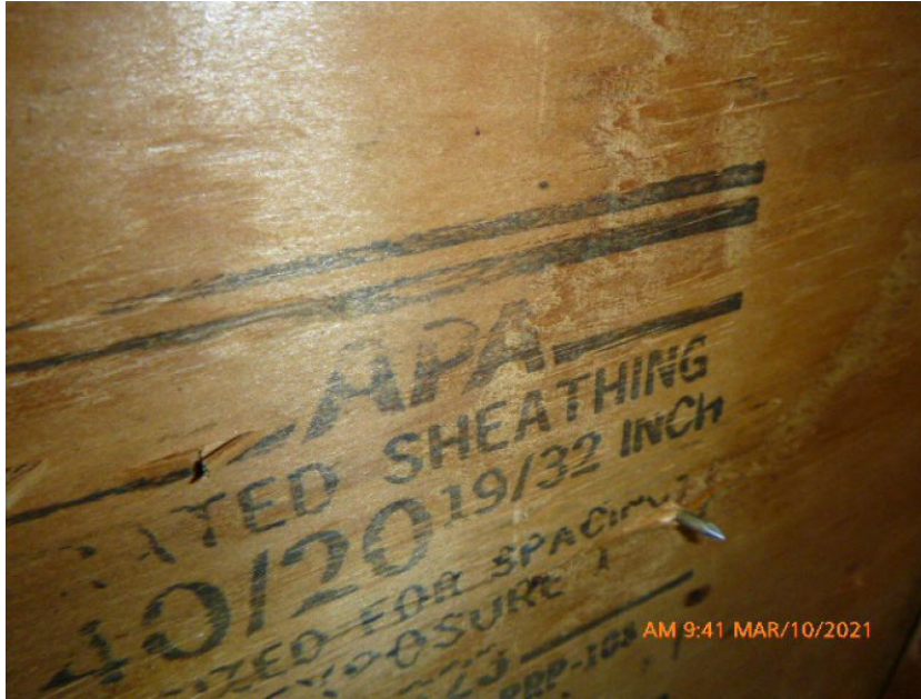
19/32" Deck Thickness Confirmed