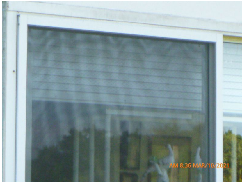
Rolldown Shutter - Unverified as Impact