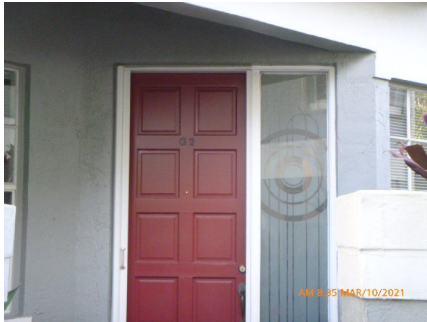
Unprotected Solid Entry Door