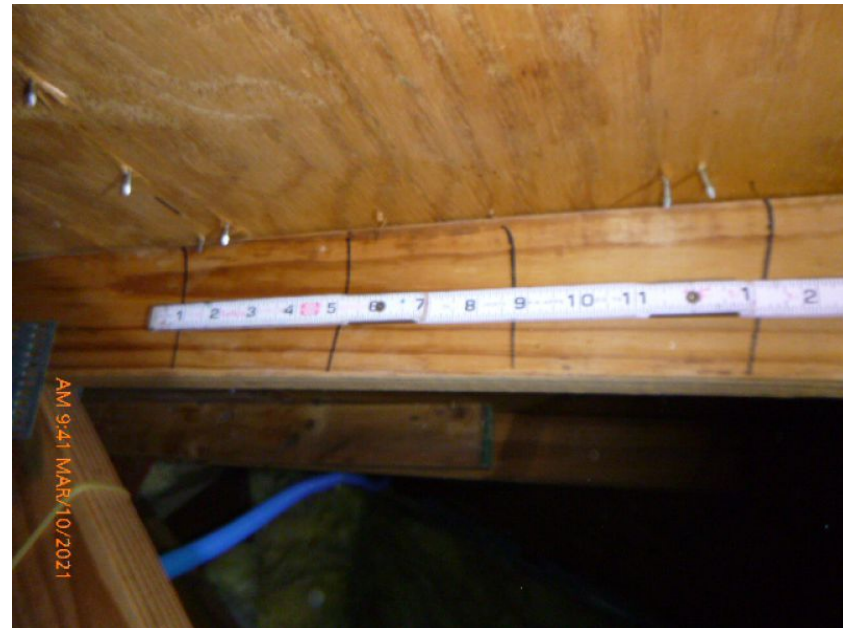
8d Nails or Greater in Size Spaced 6" in the Field