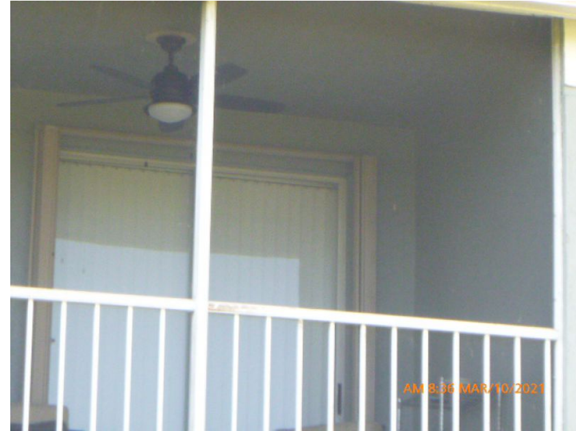
Accordion Shutter - Unverified as Impact