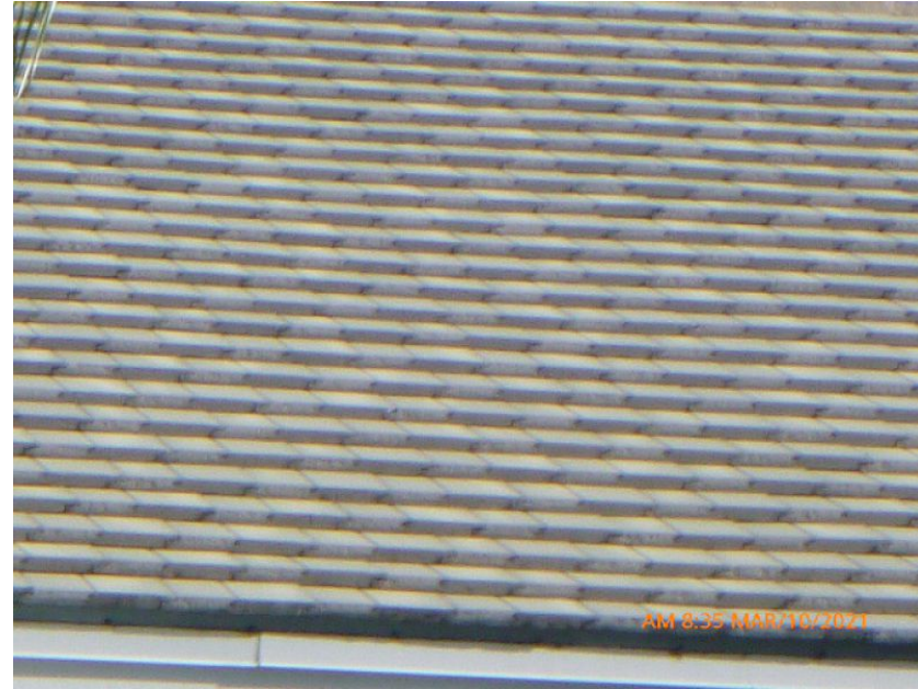
Concrete/Clay Tile Roof Covering