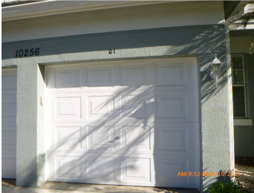
Unprotected Solid Garage Door