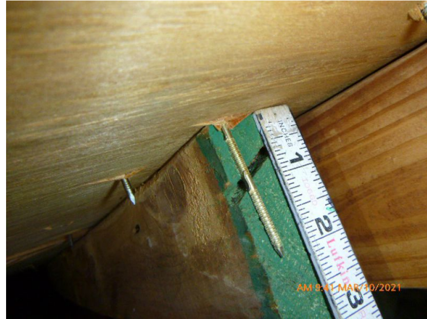
8d Nails or Greater in Size