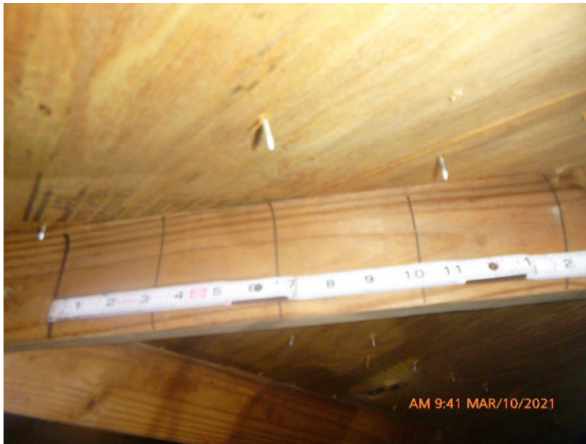
8d Nails or Greater in Size Spaced 6" Along the Edge