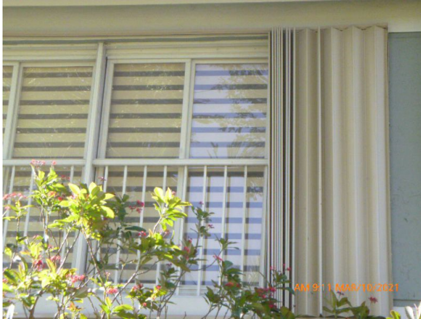
Accordion Shutter - Unverified as Impact