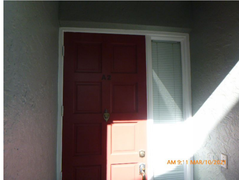
Unprotected Solid Entry Door