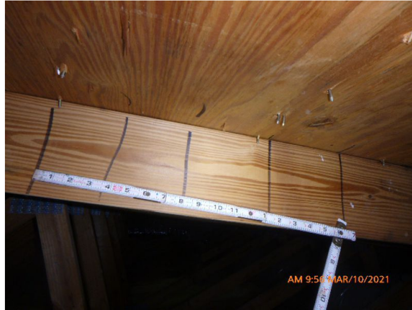
8d Nails or Greater in Size Spaced 6" Along the Edge