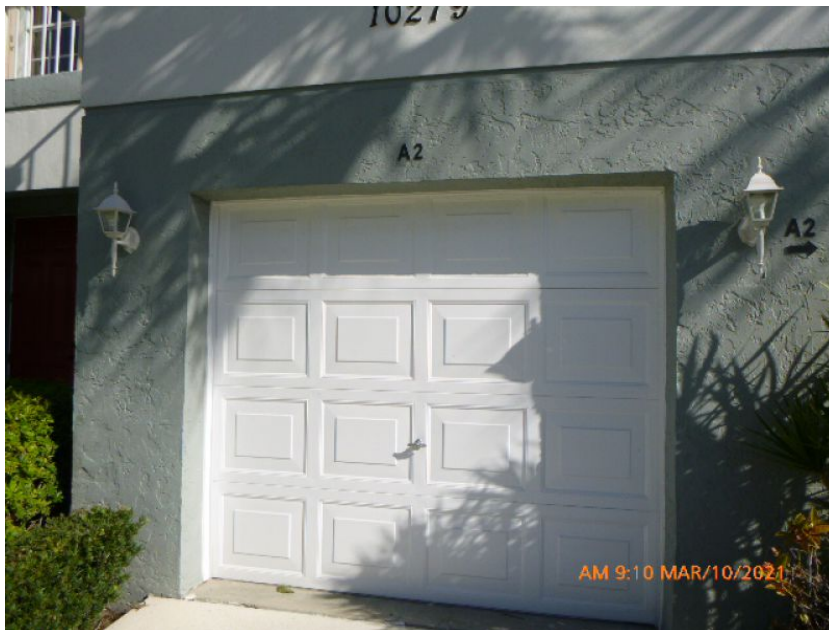
Unprotected Solid Garage Door