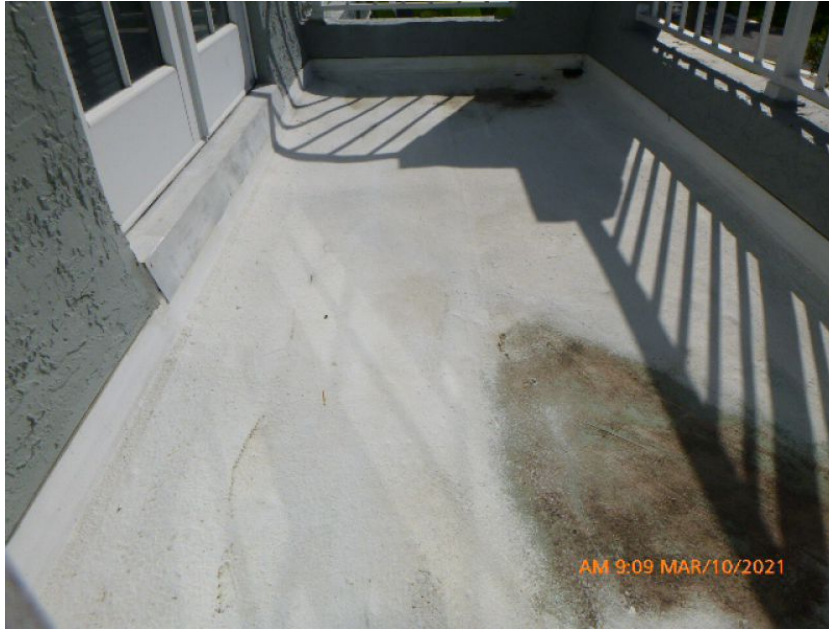
Built-Up/Rolled Asphalt Roof Covering