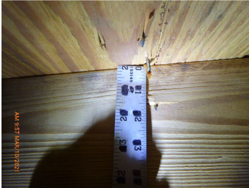
8d Nails or Greater in Size