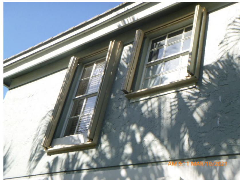
Accordion Shutter - Unverified as Impact