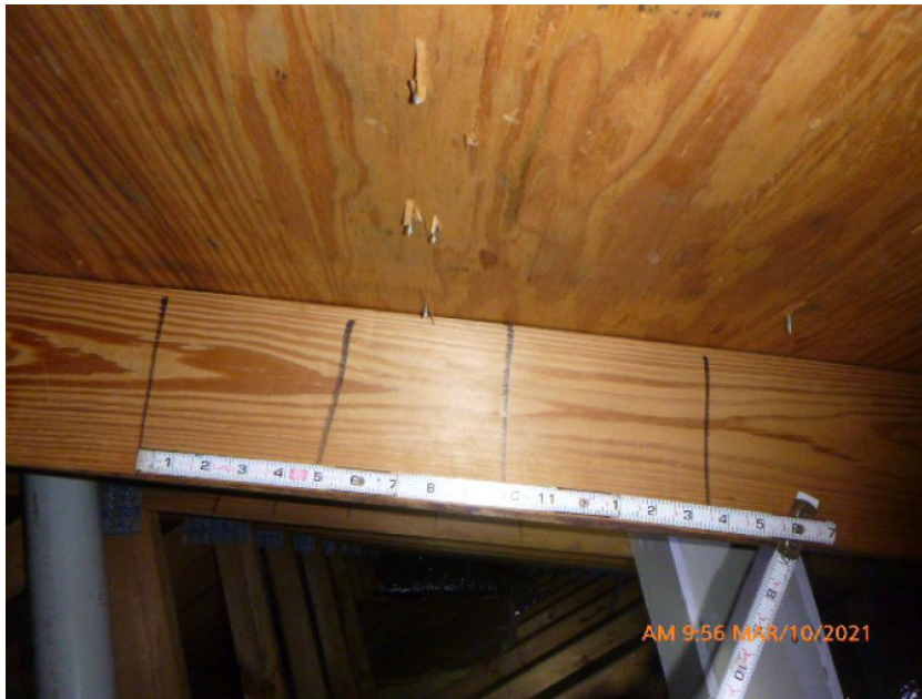
8d Nails or Greater in Size Spaced 6" in the Field