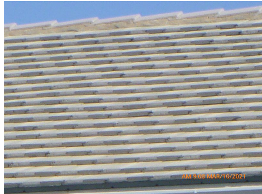
Concrete/Clay Tile Roof Covering