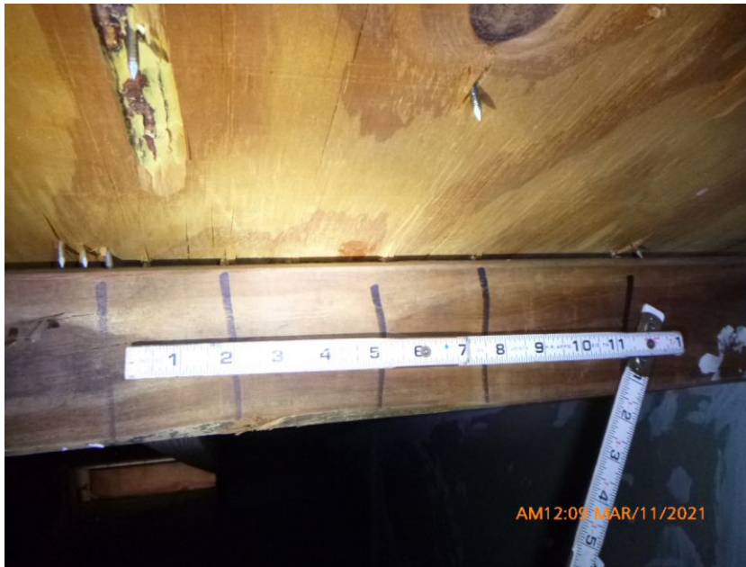
8d Nails or Greater in Size Spaced 6" Along the Edge