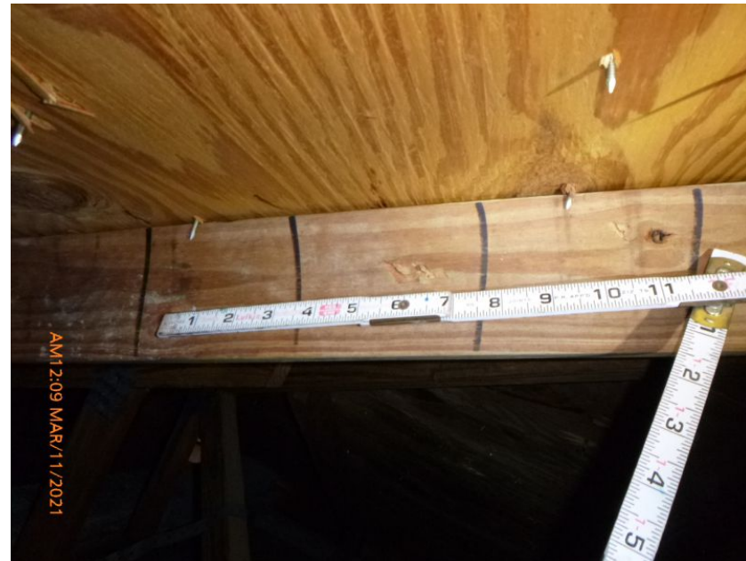
8d Nails or Greater in Size Spaced 6" in the Field