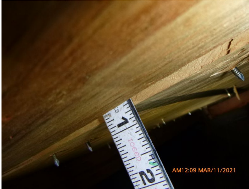
19/32" Deck Thickness Confirmed