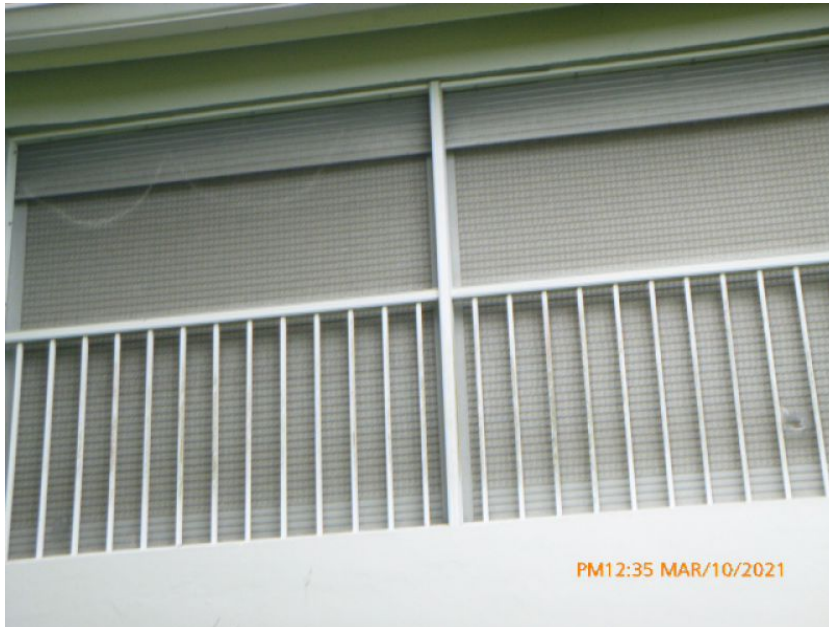
Rolldown Shutter - Unverified as Impact