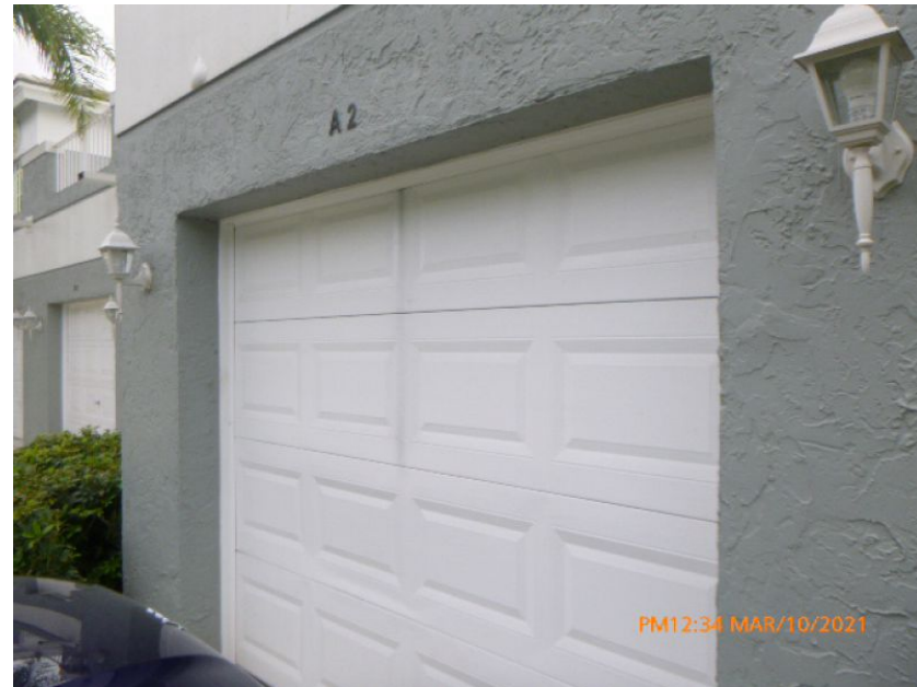
Unprotected Solid Garage Door