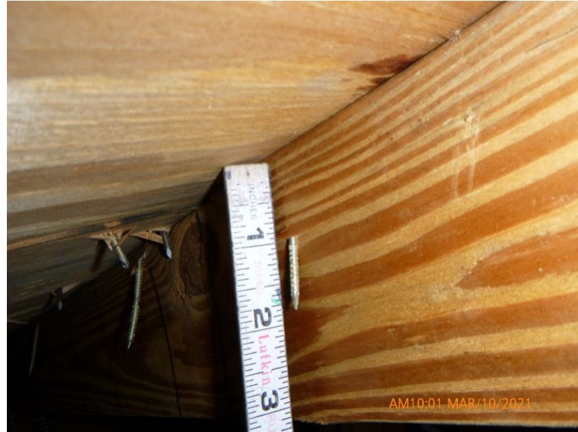
8d Nails or Greater in Size