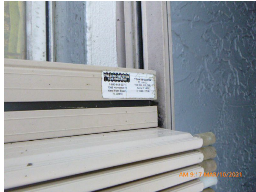
Impact Rated Accordion Shutter Label