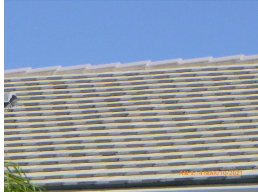
Concrete/Clay Tile Roof Covering