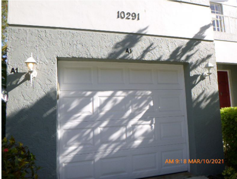
Unprotected Solid Garage Door