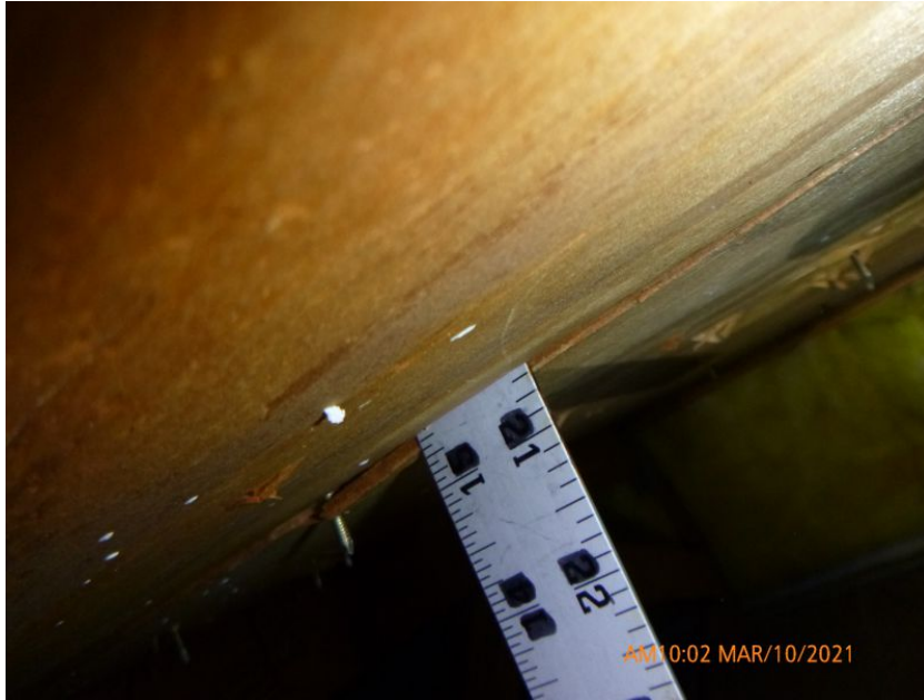
19/32" Deck Thickness Confirmed