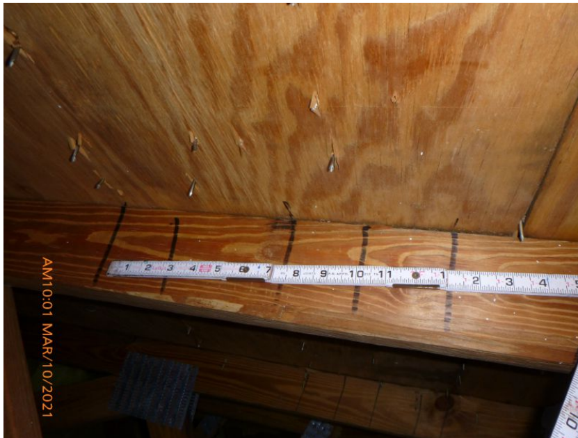
8d Nails or Greater in Size Spaced 6" Along the Edge