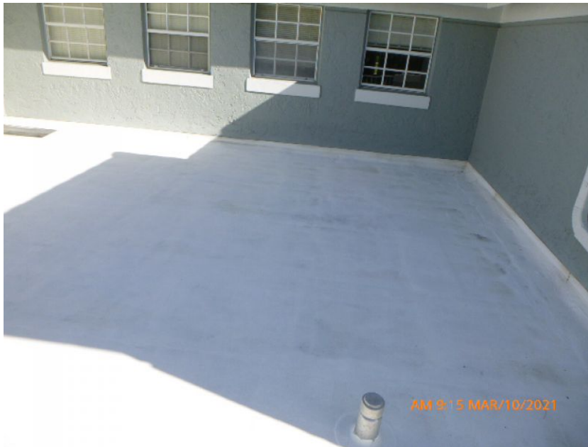
Built-Up/Rolled Asphalt Roof Covering