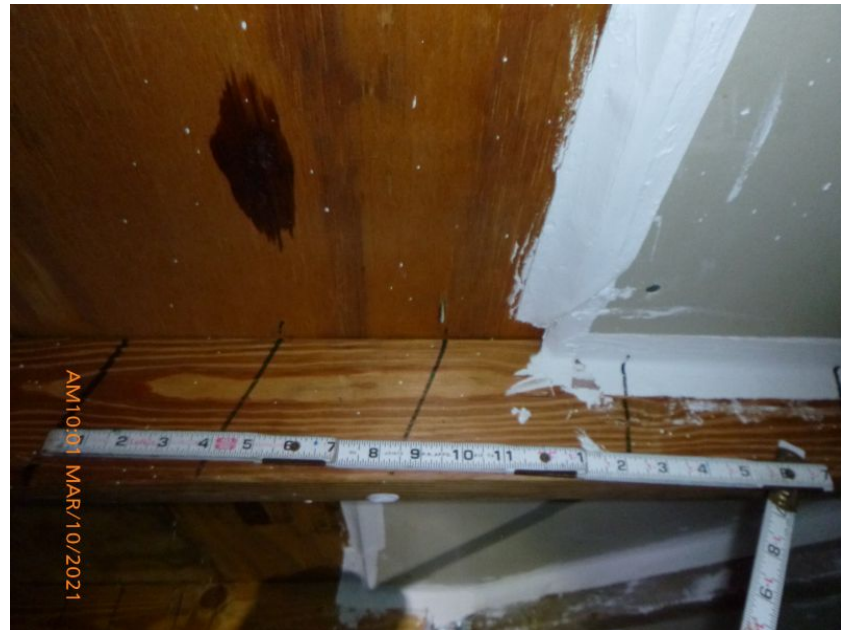
8d Nails or Greater in Size Spaced 6" in the Field