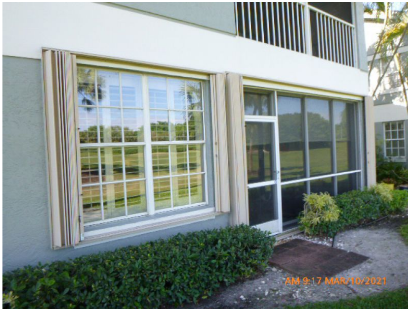
Impact Rated Accordion Shutter