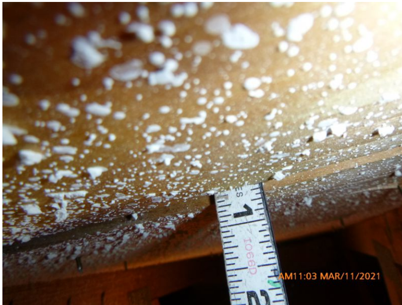
19/32" Deck Thickness Confirmed