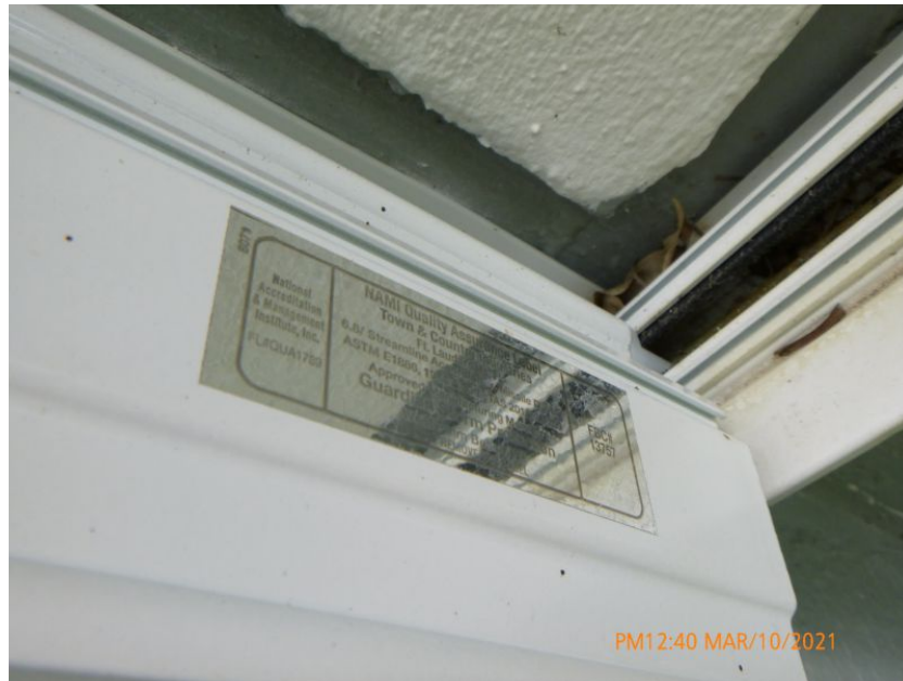
Impact Rated Accordion Shutter Label