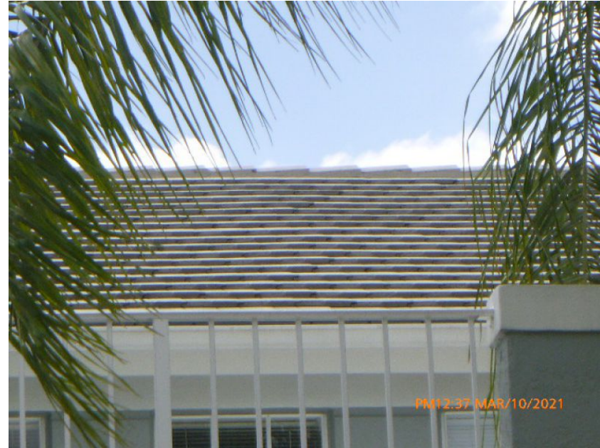
Concrete/Clay Tile Roof Covering