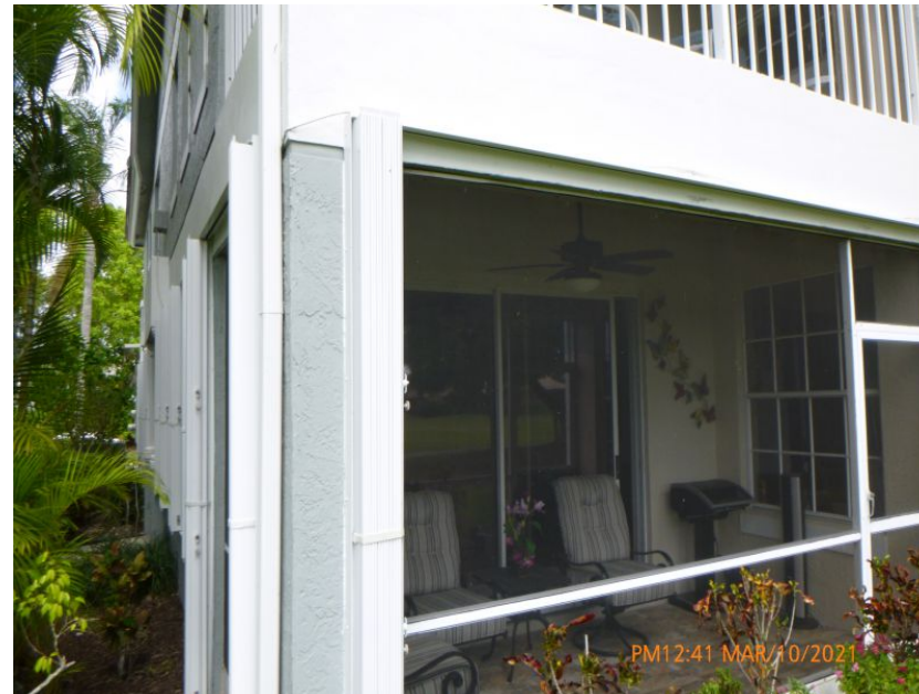
Impact Rated Accordion Shutter