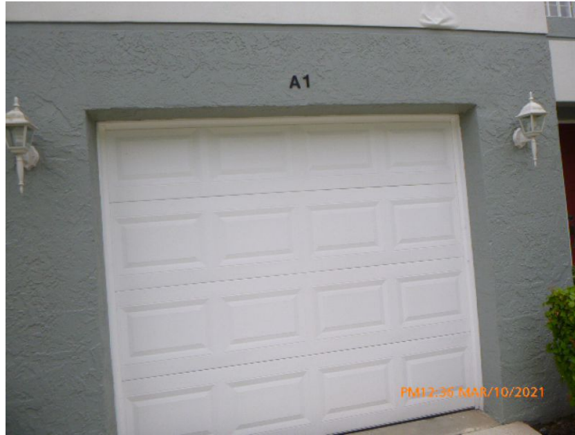
Unprotected Solid Garage Door