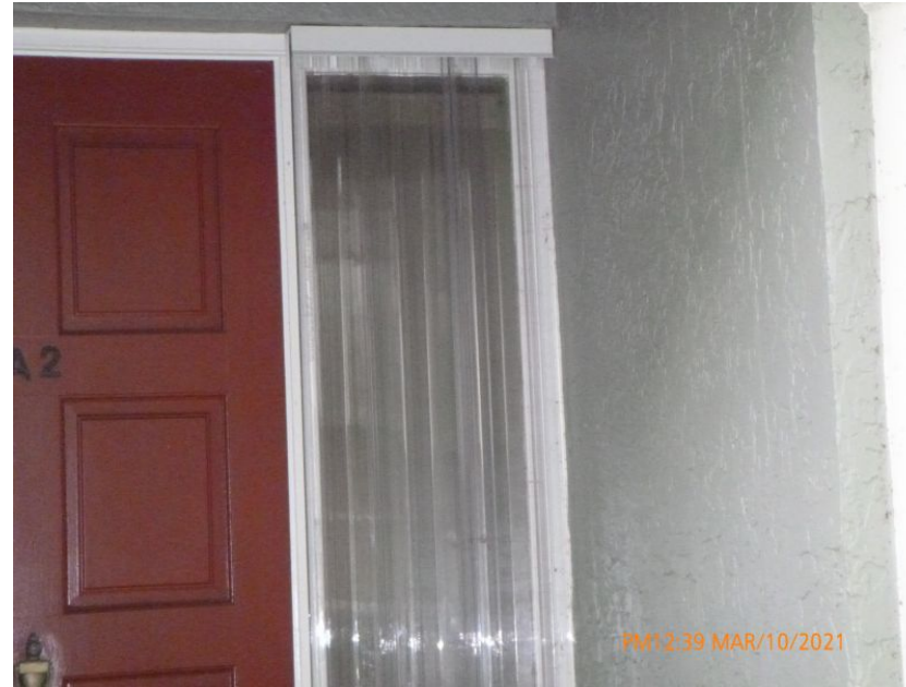
Lexan Shutter - Unverified as Impact