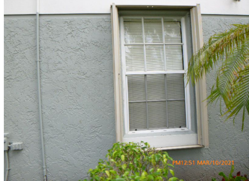
Accordion Shutter - Unverified as Impact