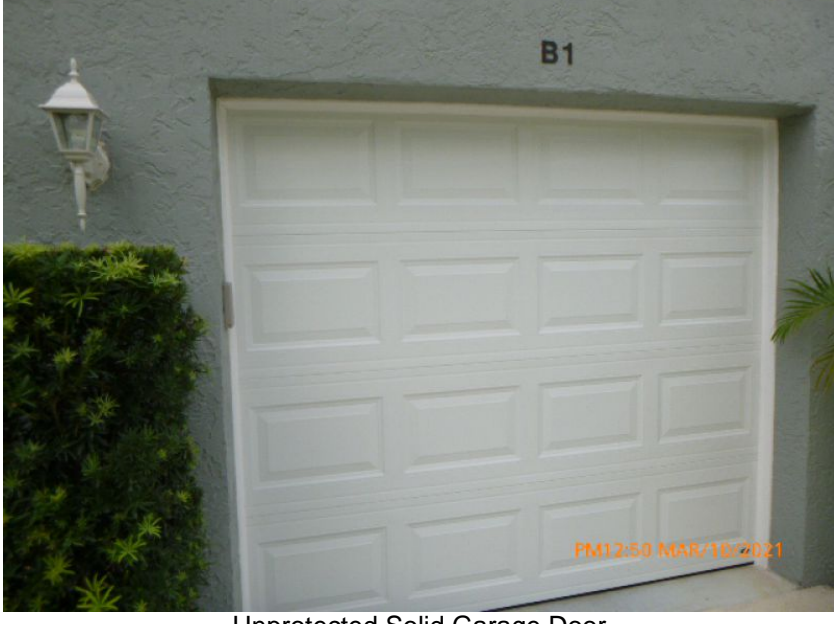
Unprotected Solid Garage Door