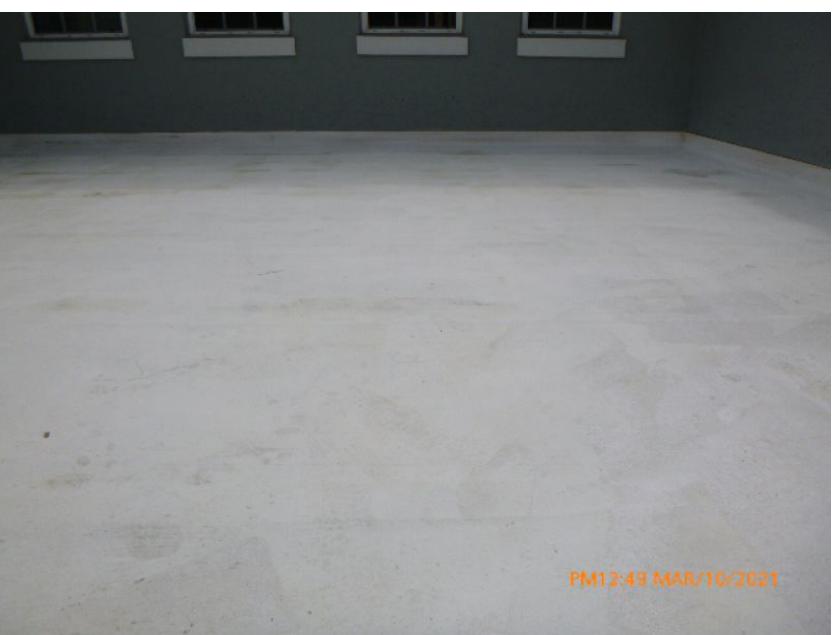
Built-Up/Rolled Asphalt Roof Covering