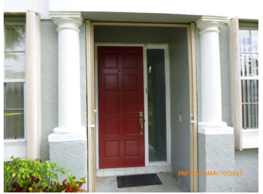
Accordion Shutter - Unverified as Impact