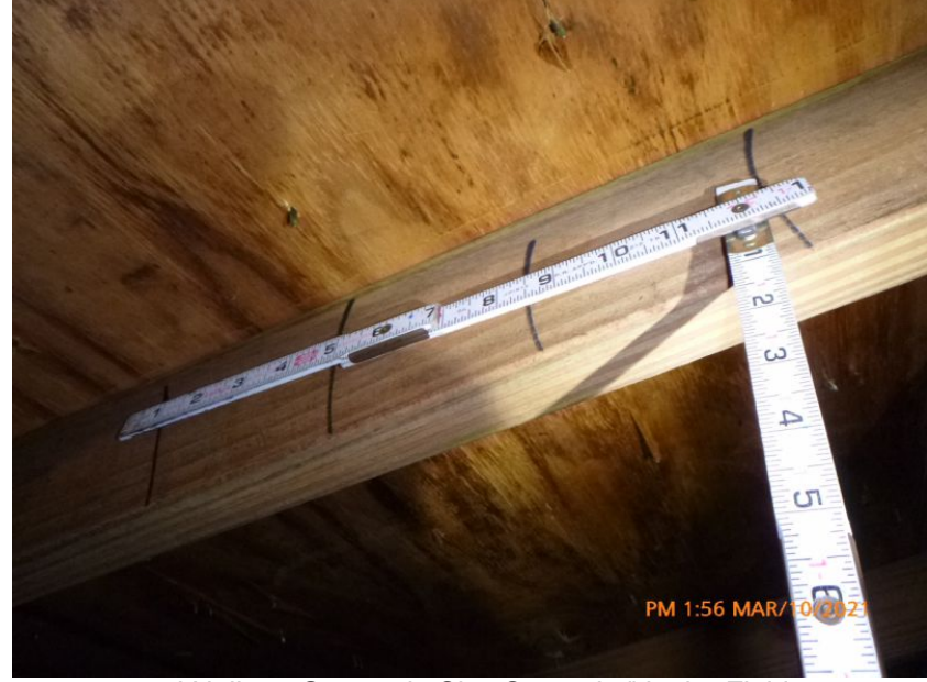
8d Nails or Greater in Size Spaced 6" in the Field