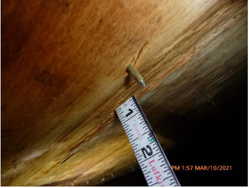
19/32" Deck Thickness Confirmed

8d Nails or Greater in Size Spaced 6" Along the Edge