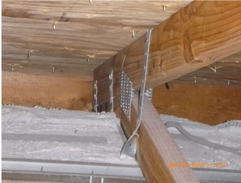
Metal Connector with 3 Nails on the Front Side & 0 Nails on the Opposing Side