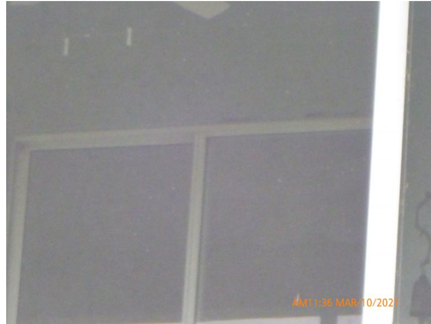
Unprotected Glazed Entry Door