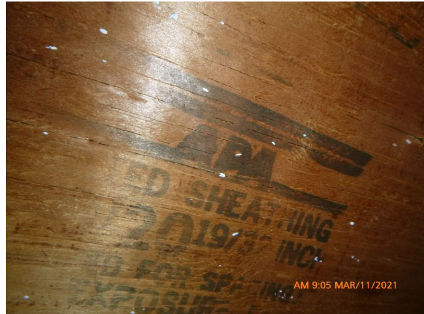
19/32" Deck Thickness Confirmed