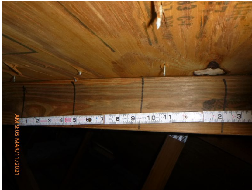
8d Nails or Greater in Size Spaced 6" in the Field