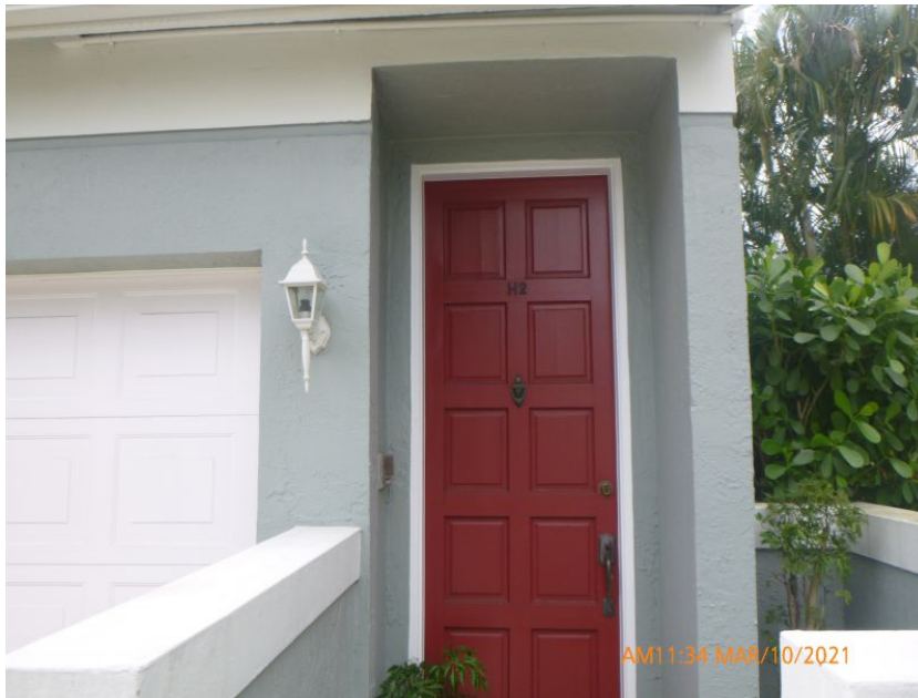
Unprotected Solid Entry Door