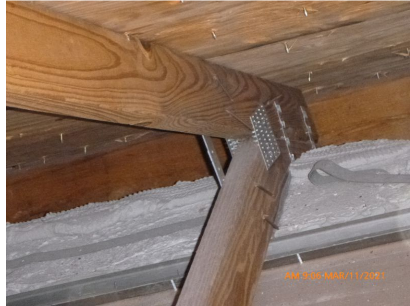
Metal Connector with 3 Nails on the Front Side & 0 Nails on the Opposing Side