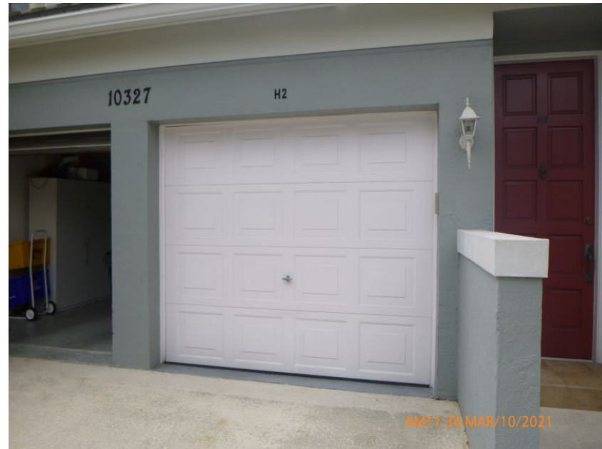
Unprotected Solid Garage Door