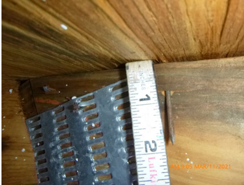
8d Nails or Greater in Size