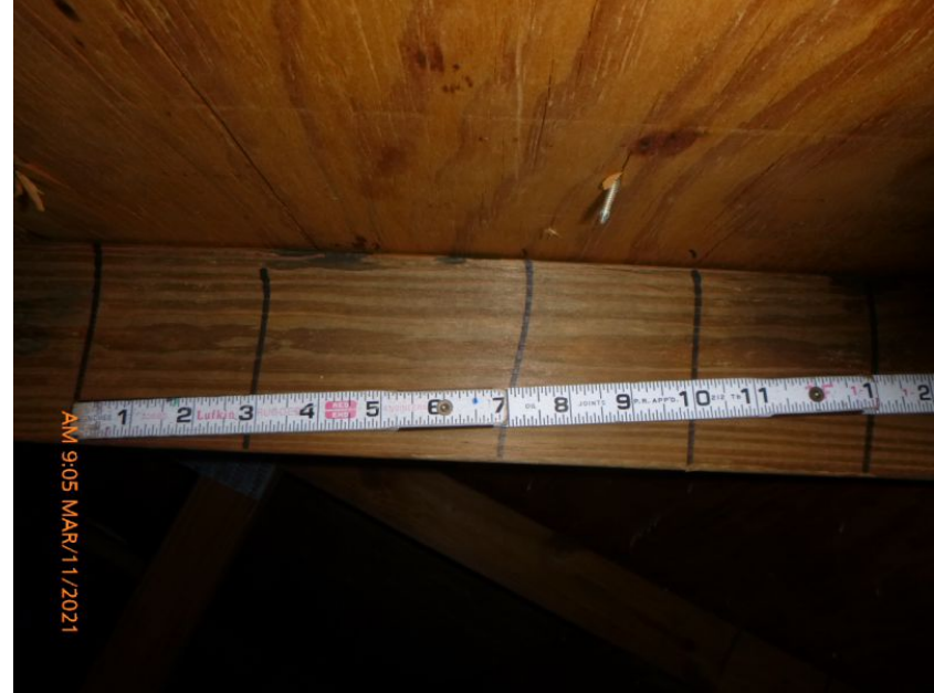
8d Nails or Greater in Size Spaced 6" Along the Edge