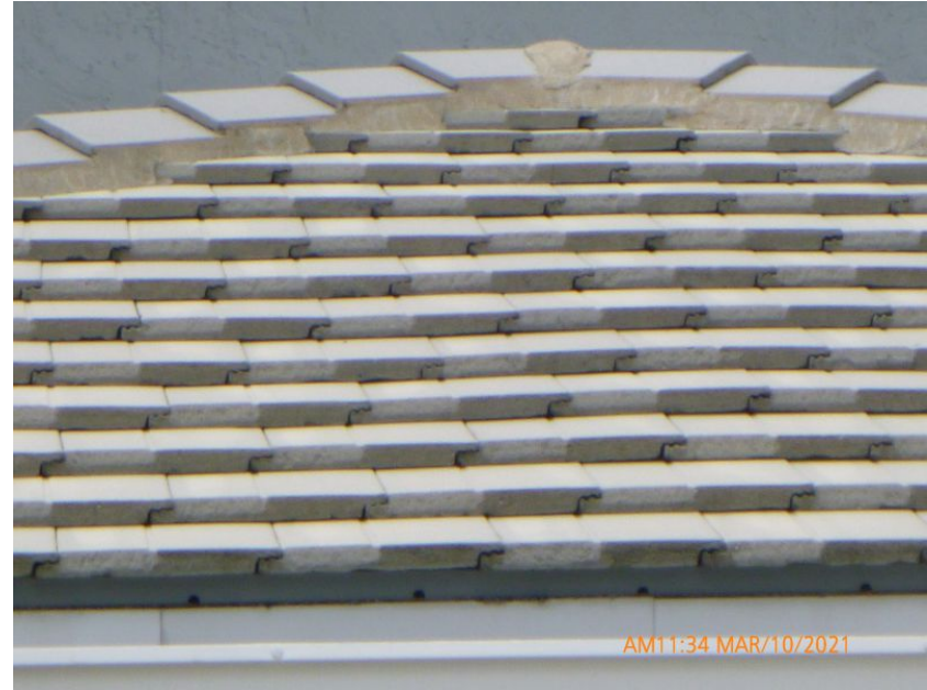
Concrete/Clay Tile Roof Covering