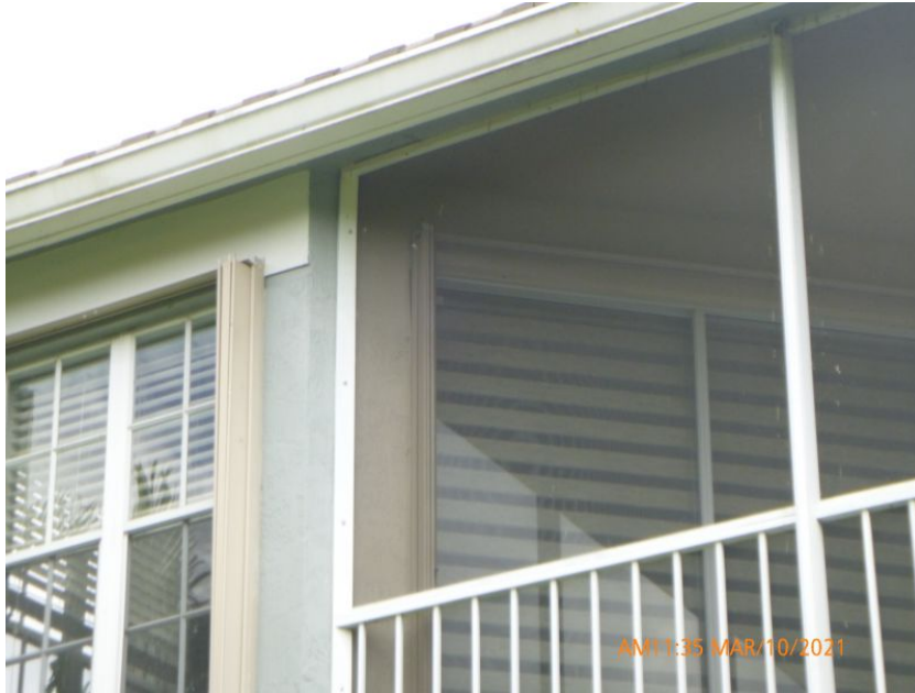
Accordion Shutter - Unverified as Impact