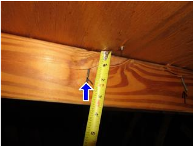
Roof to Deck Connection - 8D Nailing