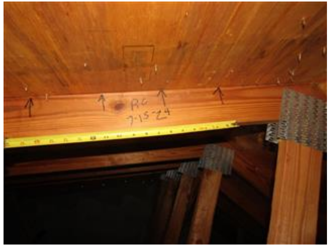
Roof to Deck Connection