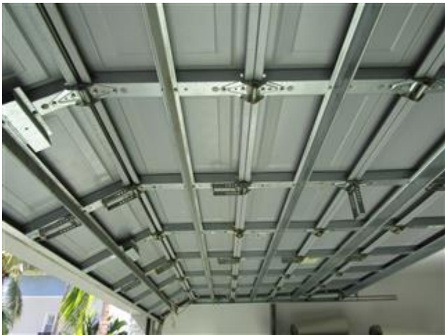
Hurricane Garage Doors