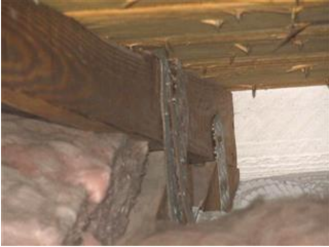
Roof to Wall Connection - Double Straps