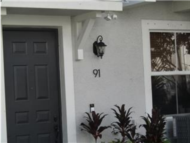
Hurricane Solid Doors