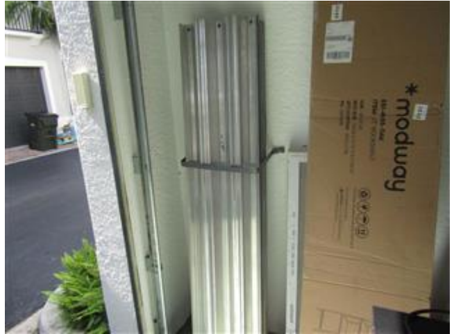
Hurricane Impact Shutters