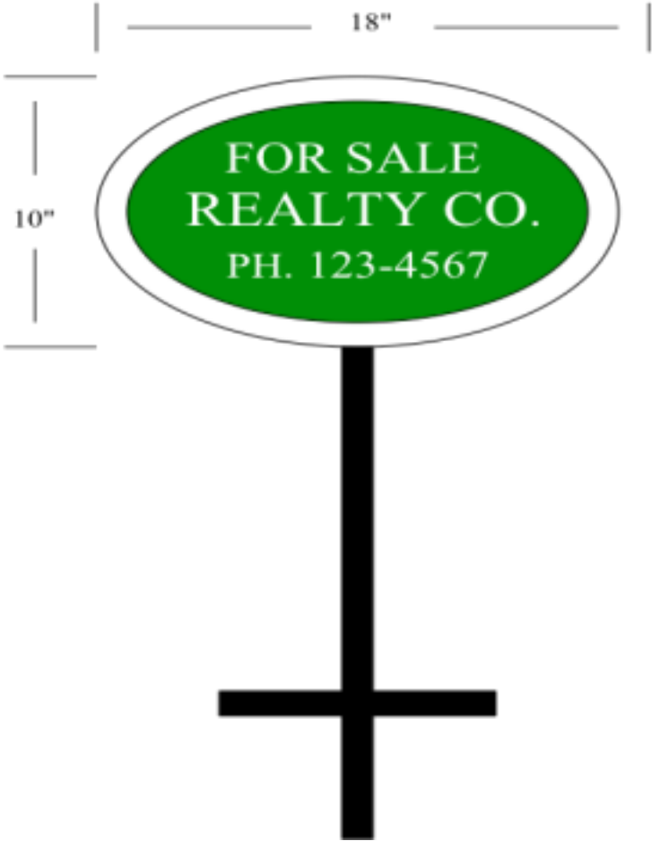
10" x 18" PVC sign, green background with white lettering and border, mounted to metal step stake.

Approved for sale/lease signs are permitted. Signs must be 10” x 18” PVC oval shape, dark green background with white letters and border.