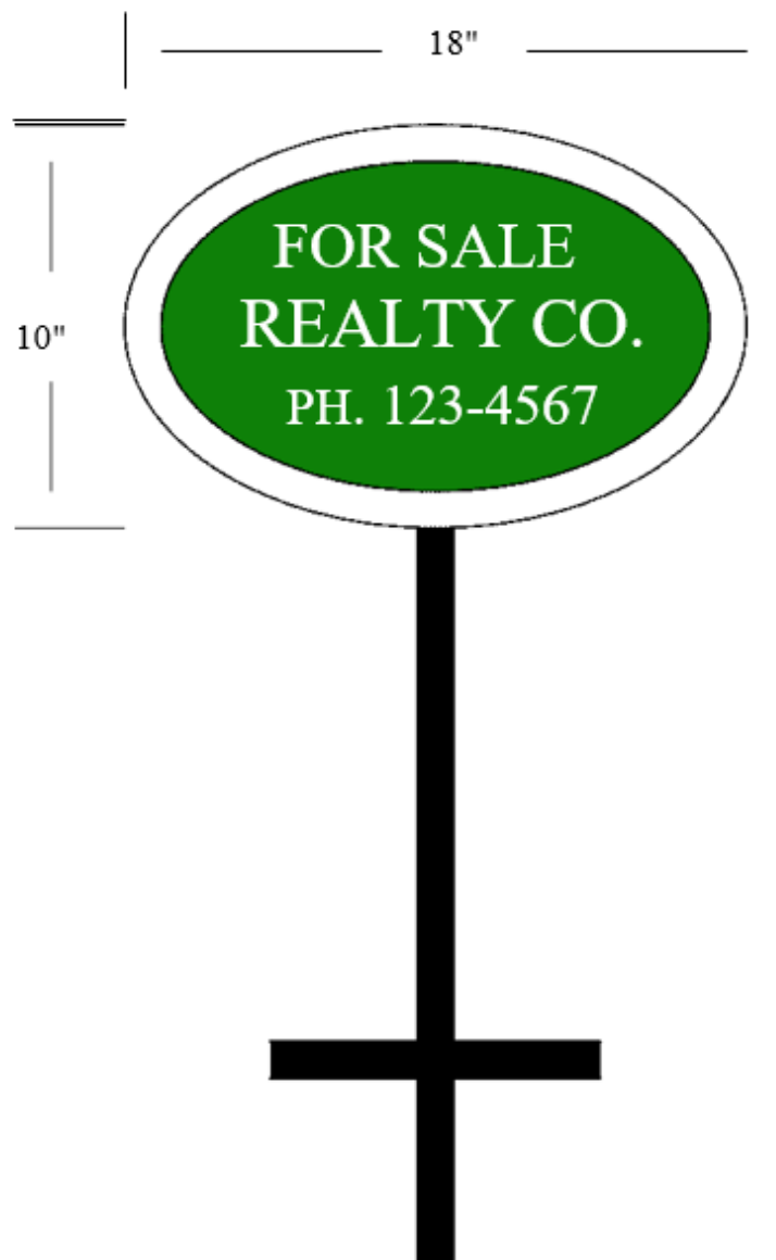
10" x 18" PVC sign, green background with white lettering and border, mounted to metal step stake.

A sign from a contractor for security services does not need approval if it is within 5 feet of the house. It must be no larger than 100 square inches.